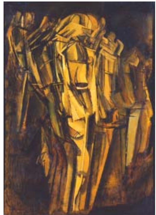
Above: Marcel Duchamp's Nude (Study), Sad Young Man on a Train (Nu [esquisse], Jeune homme triste dans un train) , 1911–1912. Oil on cardboard, mounted on Masonite; 39 3/8 × 28 3/4 inches (100 × 73 cm). The Solomon R. Guggenheim Foundation, New York. Peggy Guggenheim Collection, Venice, 1976. 76.2553.9.