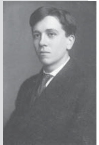
Manierre Dawson ca. 1906.