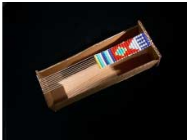
Home-made Loom with Pony Beads

Cut off a one-yard length of beading thread. Thread one end through the eye of your needle. Pull the thread through until the length is almost halved (you will adjust as you bead). Tie the long end of your thread to the outside warp thread on the loom (which side depends on whether you are left- or right-handed), leaving at least an inch or two of the end hanging (you will tuck it through the first row of beads later).