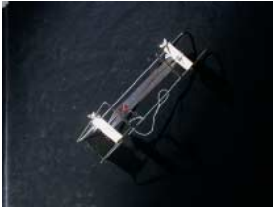
Commercial Loom with Seed Beads

until the thread has gone through all the slits needed (one more than the number of beads wide your design is). Cut and tie off the thread on the nearest screw.