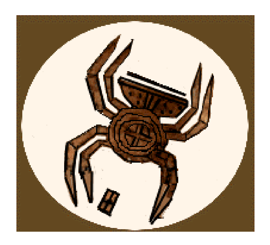
Spider Gorget Pattern #2