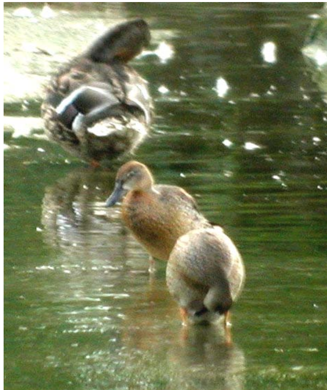
Cinnamon Teal- ♀? Lake Springfield beach, September 7, 2007 (HDB)