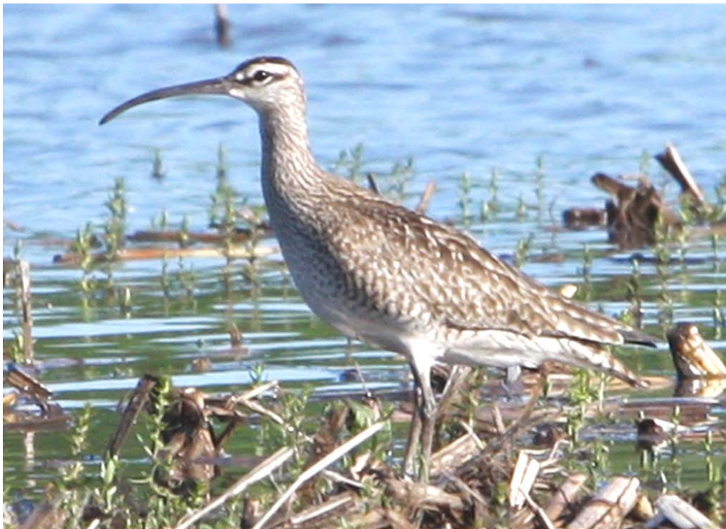
Whimbrel- adult in the valley of the South Fork, May 19, 2009 (HDB)