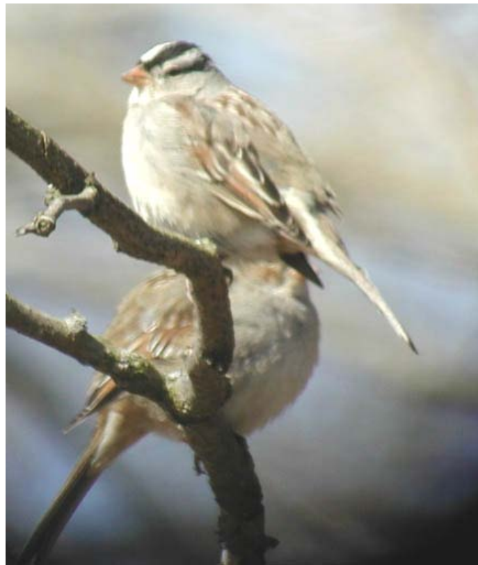
White-crowned Sparrow adult ( gambelii ) at Wahl Road, March 9, 2003 (HDB)