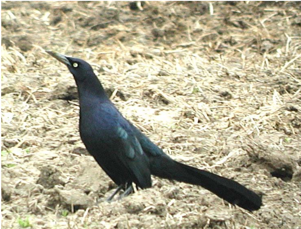
Great-tailed Grackle- ♂ north of Andrew, April 1, 2005