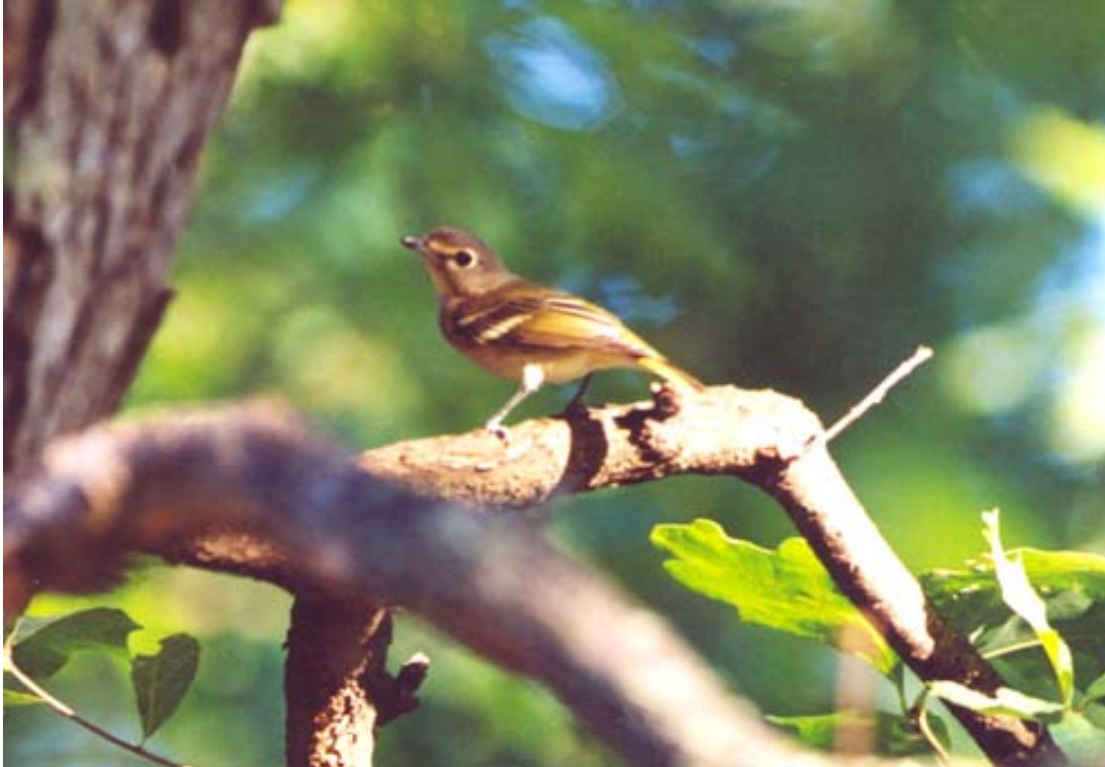
Cassin's Vireo- adult ♀? at Washington Park, September 1, 2000 (DO)