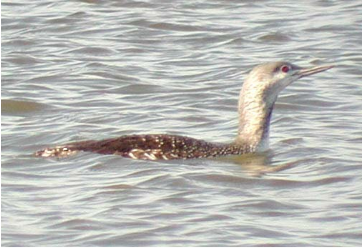
Red-throated Loon- juvenile at Lake Springfield, November 22, 2001 (HDB)