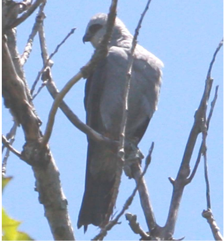
Red-shouldered Hawk- adult near Marine Pt., December 12, 2008 (HDB)