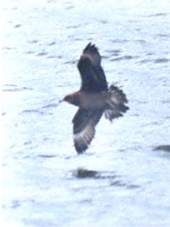
Pomarine Jaeger- immature at Lake Springfield, October 7, 1988 (DO)