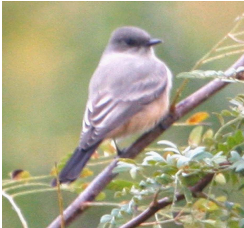
Say's Phoebe- adult on west side Sangchris, October 1, 2009 (HDB)