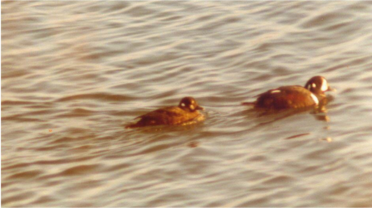
Harlequin Duck- pair at Lake Springfield, January 7, 1984 (DO)