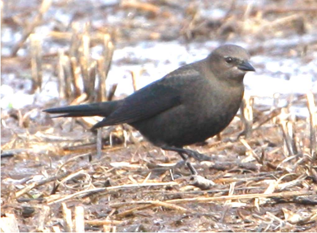
Brewer's Blackbird- ♀ at Berry, November 6, 2009 (HDB)