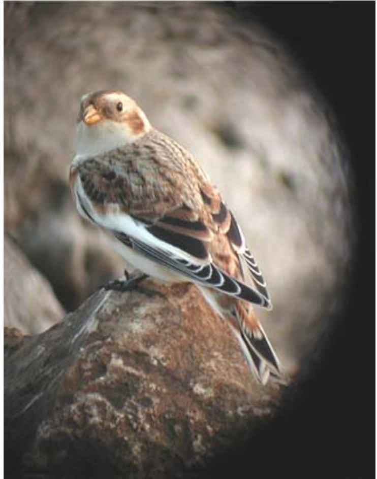
Snow Bunting- immature ♀ at Marine Pt., November 17, 2001 (HDB)