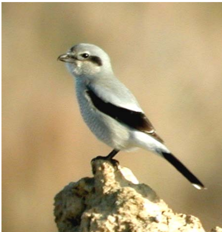
Northern Shrike- immature at Cinder Flats, November 3, 2007 (HDB)