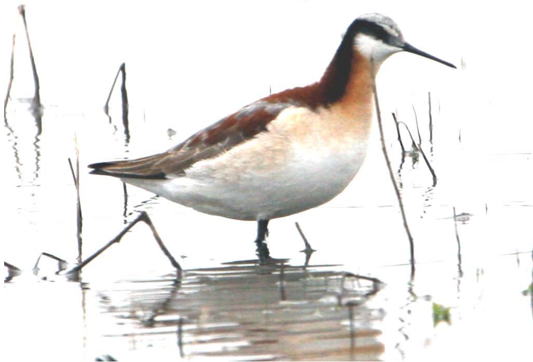
Wilson's Phalarope- ♀ at Buckhart, May 10, 2008 (HDB)