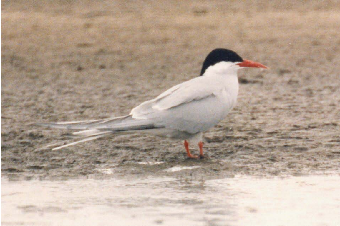
Arctic Tern- adult at Cinder Flats, June 29, 1992 (DO)