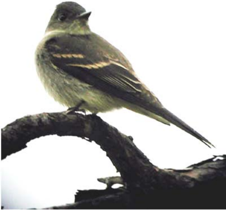
Western Wood-Pewee? Center Park, November 10, 2006 (HDB)