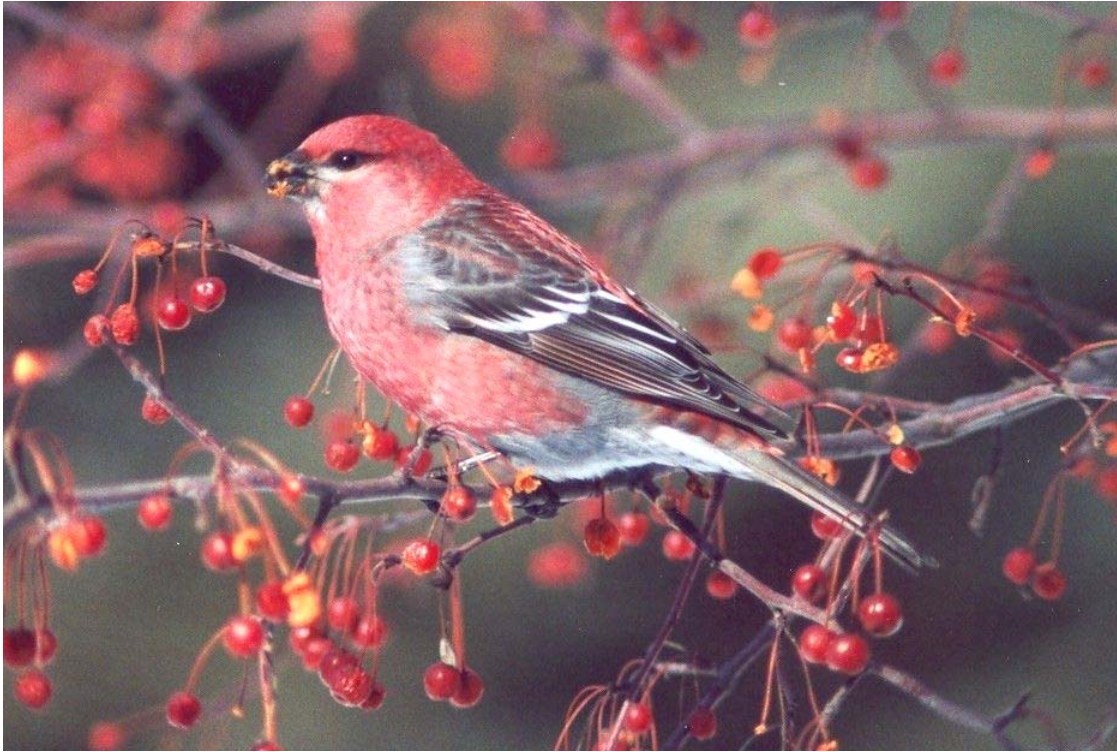
Pine Grosbeak- ♂ near airport, February 12, 1985 (DO)