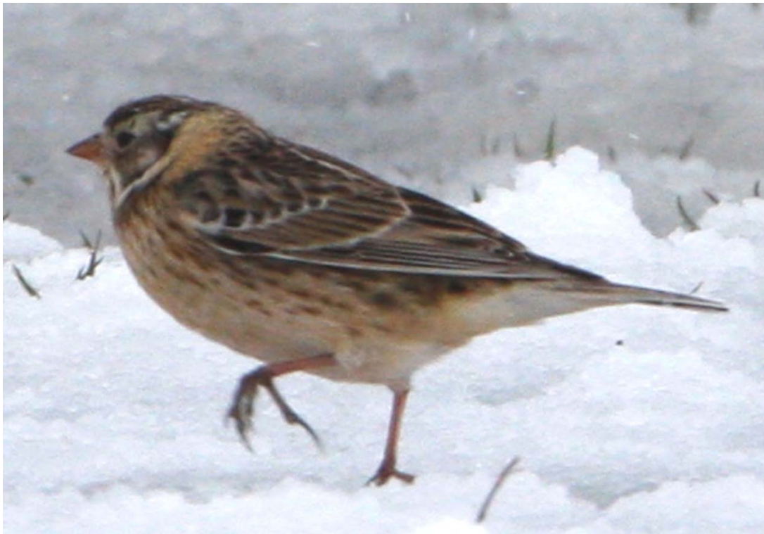
Smith's Longspur- ♂ at Sangchris, March 29, 2009 (HDB)