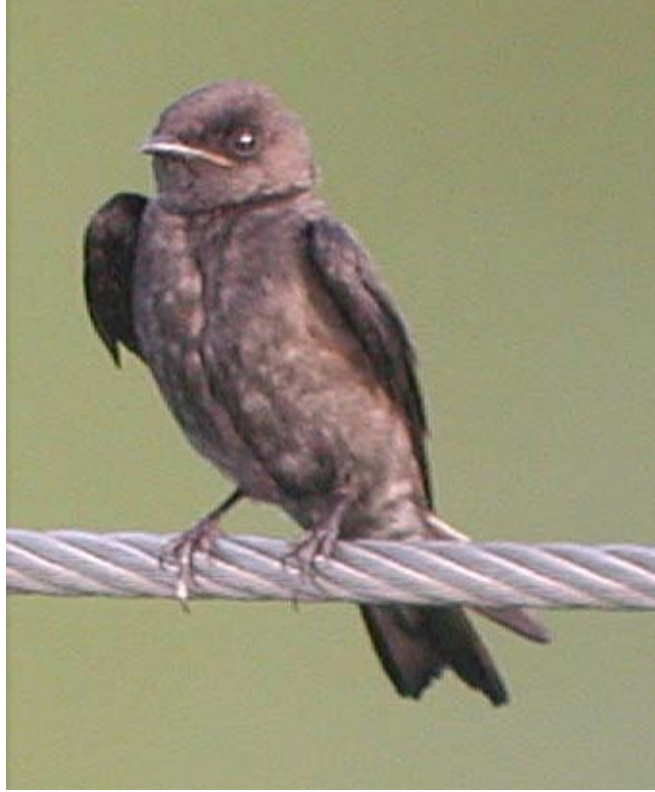
Northern Rough-winged Swallow- melanistic adult Rochester sewer pond, July 5, 2005 (HDB)