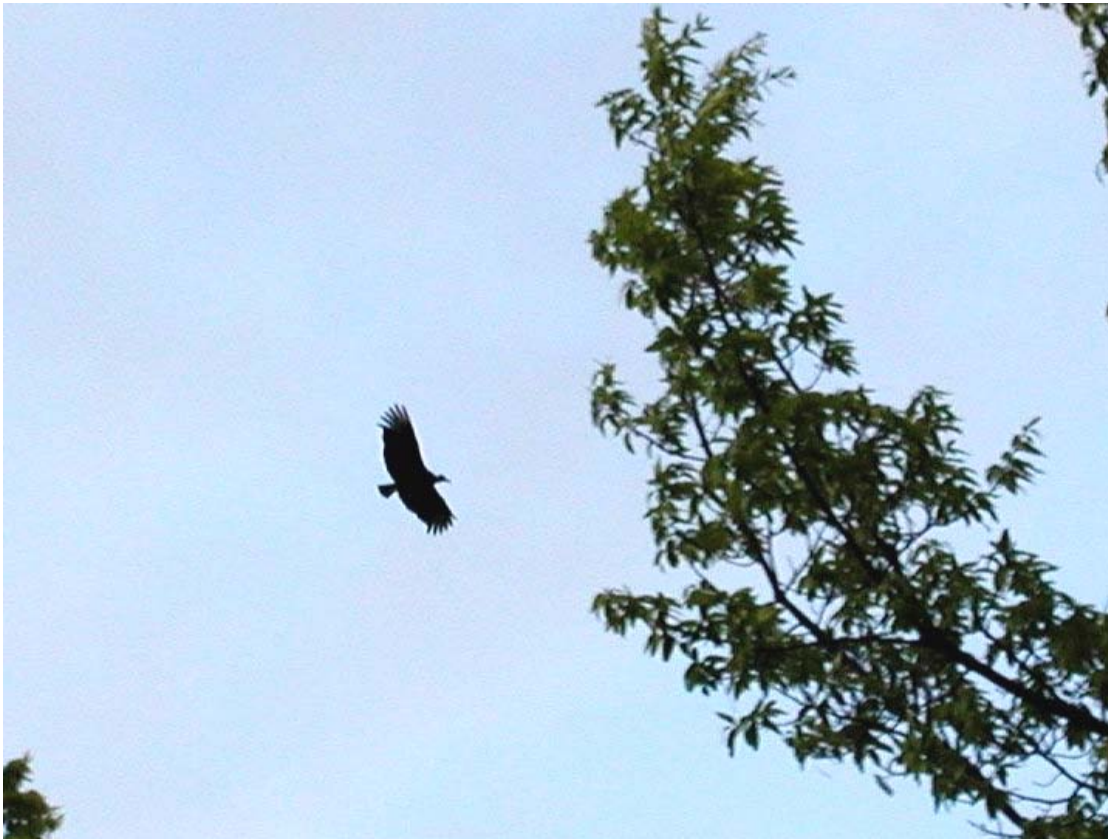
Black Vulture- at Marine Pt., April 30, 2005 (HDB)