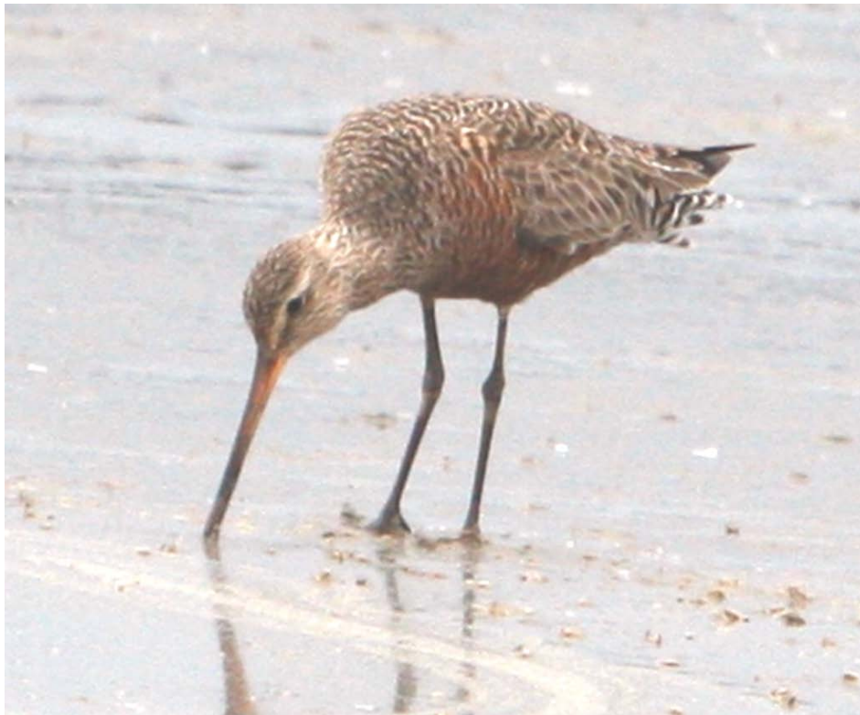
Hudsonian Godwit adult at Cinder Flats, April 25, 2009 (HDB)