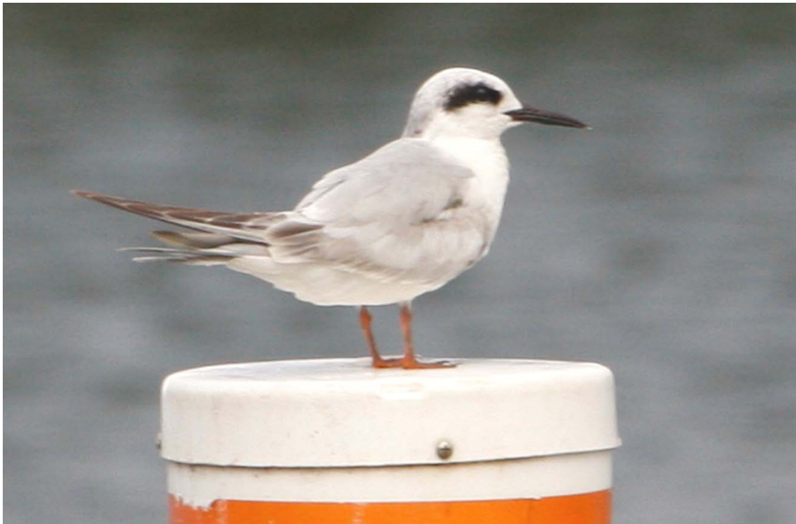
Forster's Tern- immature at Lake Springfield, June 4, 2008 (HDB)