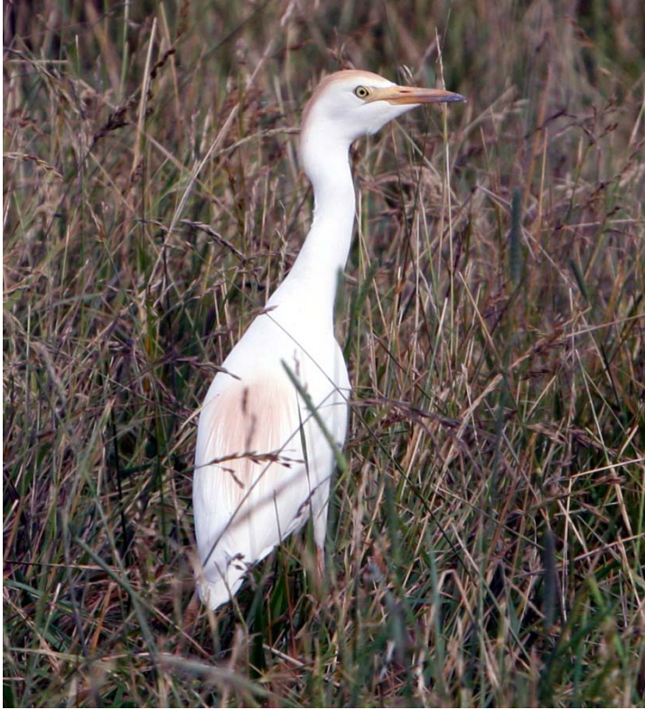
Cattle Egret- adult northeast of Berry, June 21, 2008 (HDB)