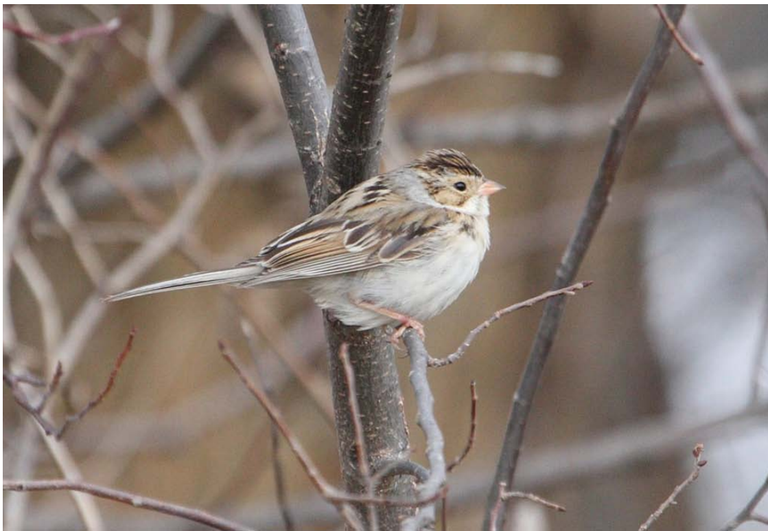
Clay-colored Sparrow- near Lake Springfield, November 23, 2007 (HDB)