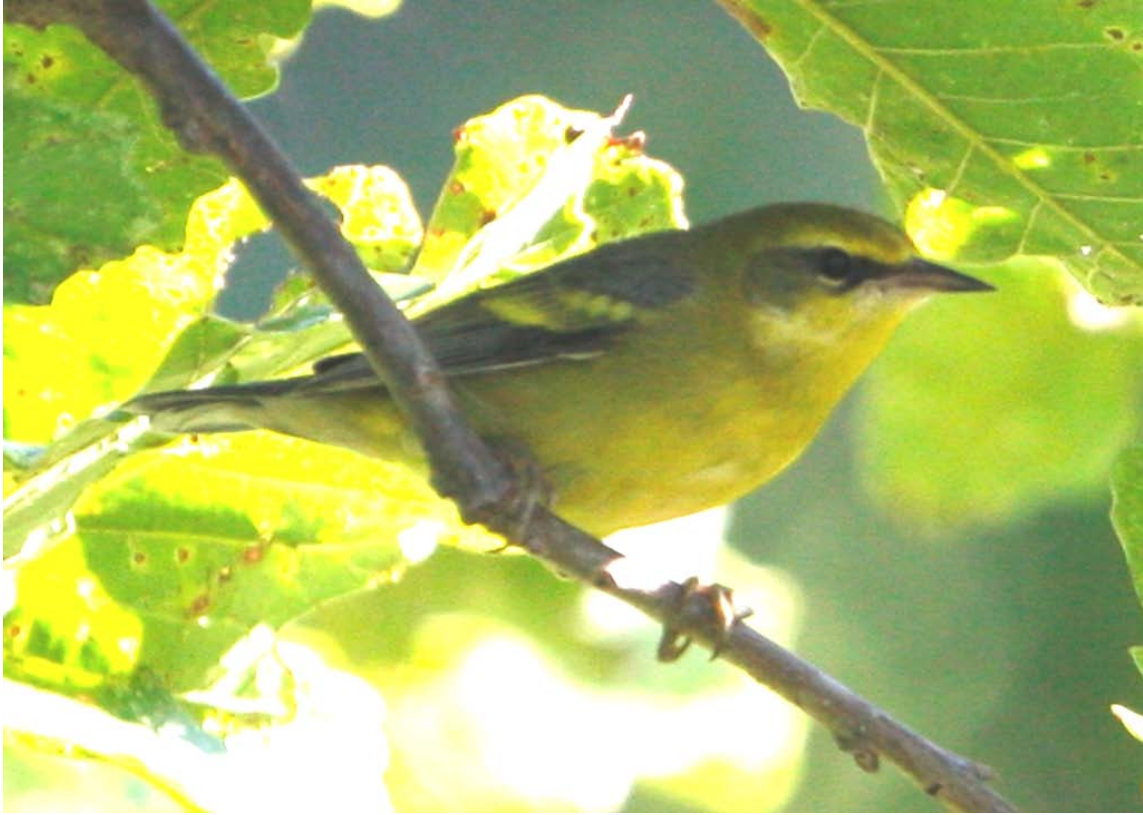
Blue-wing X Golden-wing Hybrid- ♀ Lincoln Gardens, September 17, 2009 (HDB)