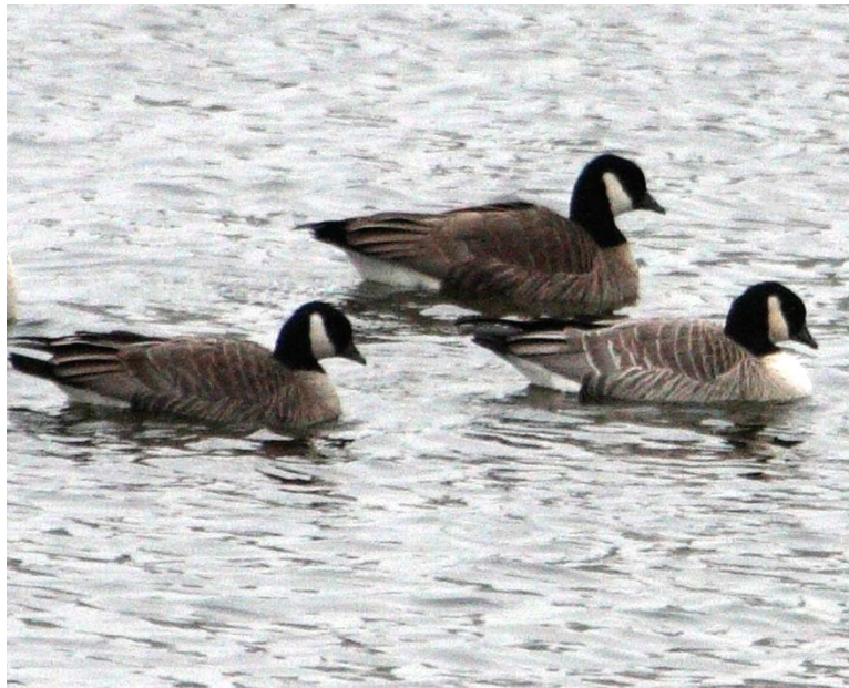
Cackling Geese- at Lake Springfield, January 26, 2008 (HDB)