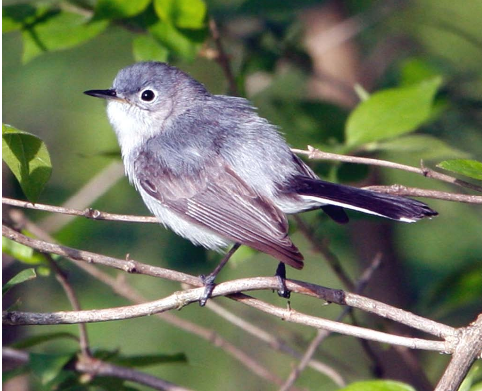
Blue-gray Gnatcatcher- ♀ at Lincoln Gardens, April 26, 2008 (HDB)