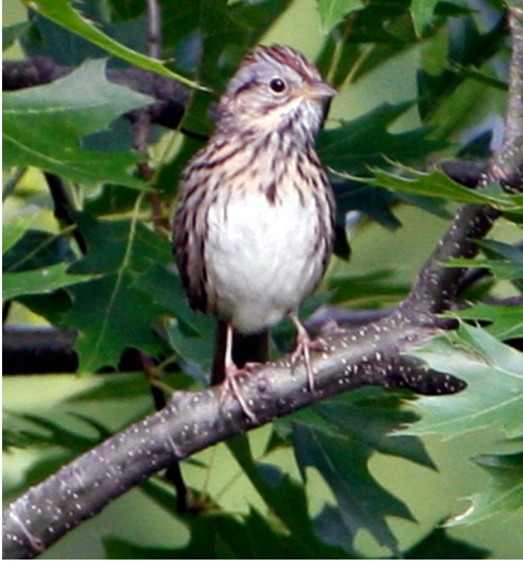
Lincoln's Sparrow- at Buckhart Bridge, July 19, 2009 (HDB)