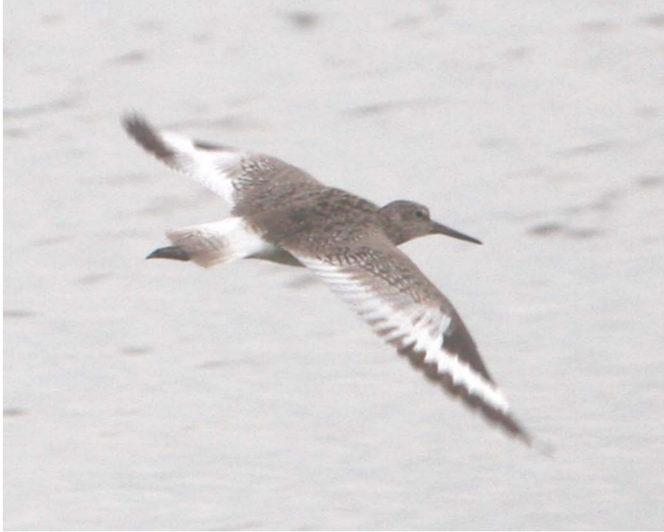
Willet- adult Lake Springfield beach, June 27, 2008 (HDB)