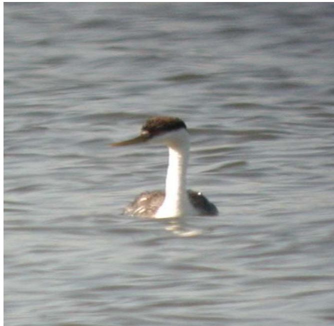
Western Grebe at Sangchris, April 9, 2006 (HDB)