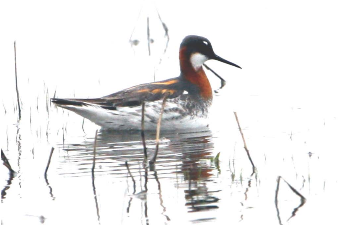
Red-necked Phalarope- ♀ at Buckhart, May 10, 2008 (HDB)