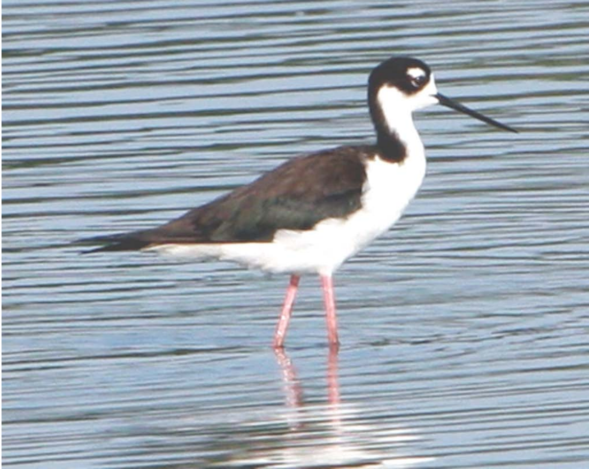
Black-necked Stilt- adult ♀ at Cinder Flats, July 16, 2009 (HDB)