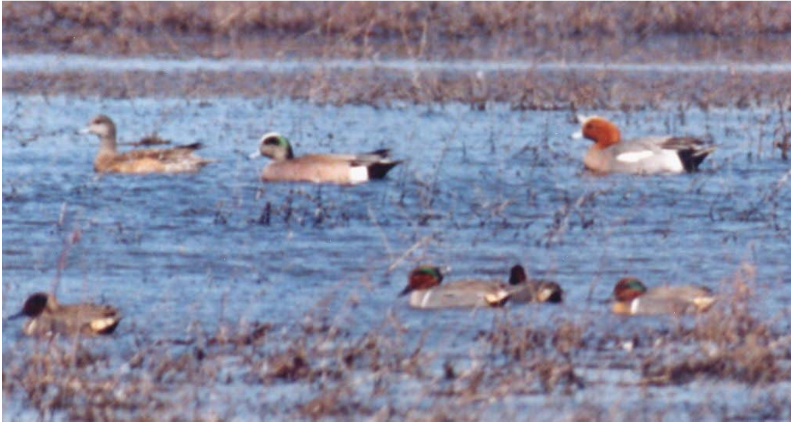
Eurasian Wigeon- adult ♂ at Buckhart Bottoms, March 15, 1994 (DO)