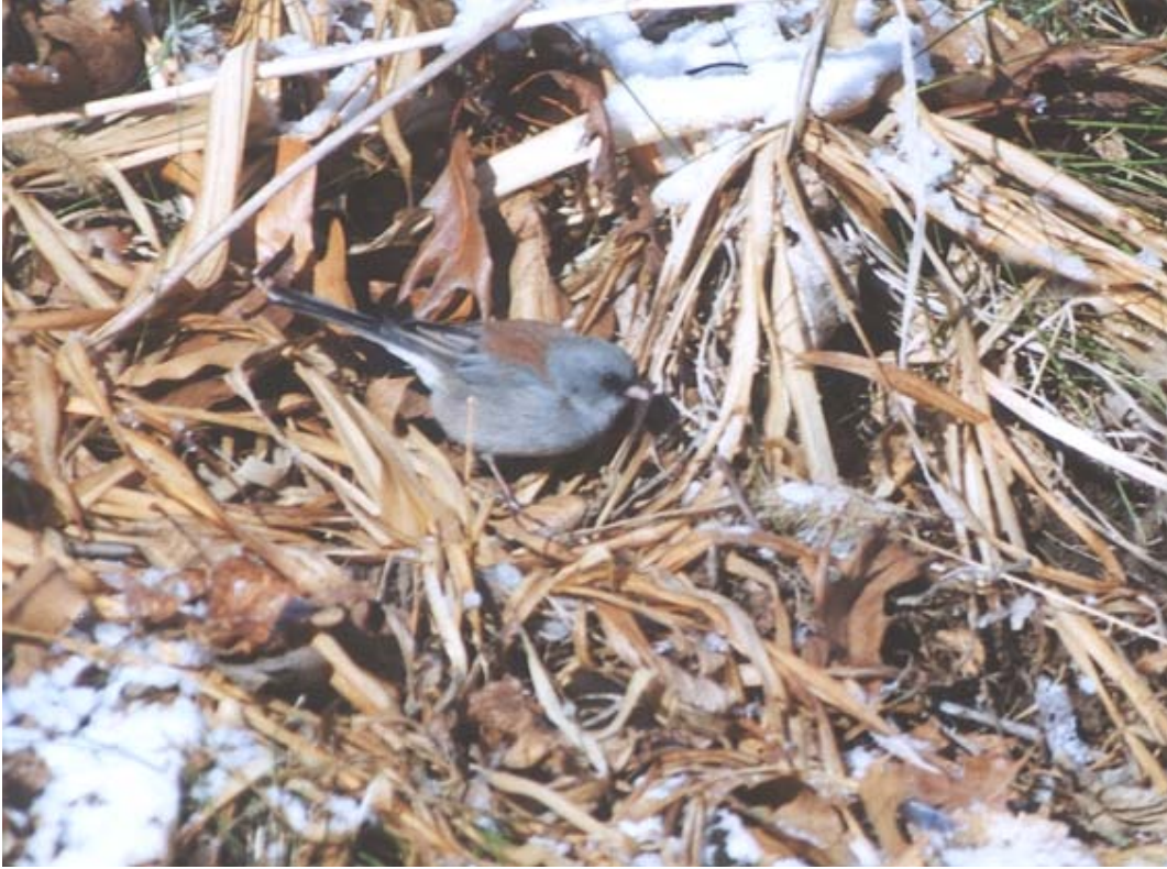
Gray-headed Junco- at Island Grove, December 12, 2000 (DO)