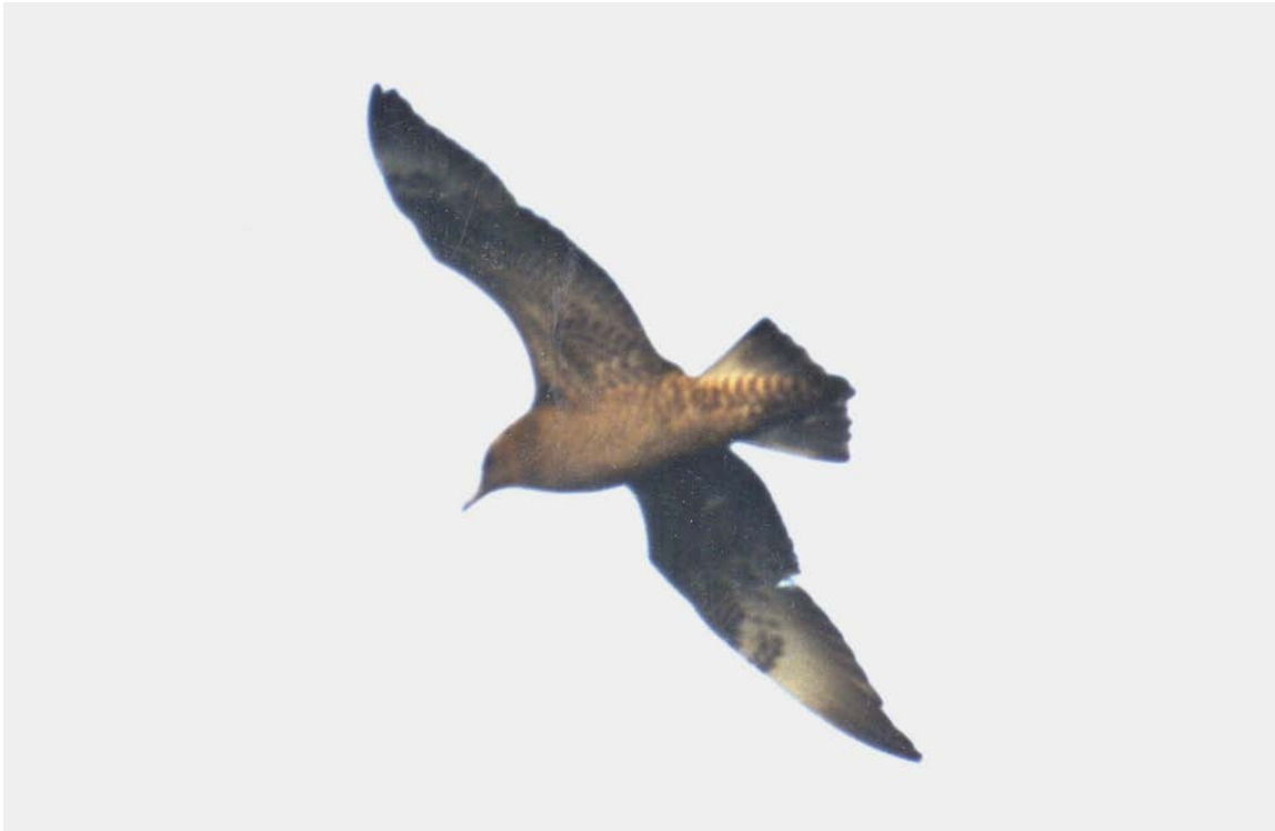
Pomarine Jaeger- immature at Lake Springfield, November 16, 1996 (DO)