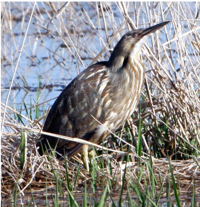
American Bittern- south of Curran, April 11, 2009 (HDB)