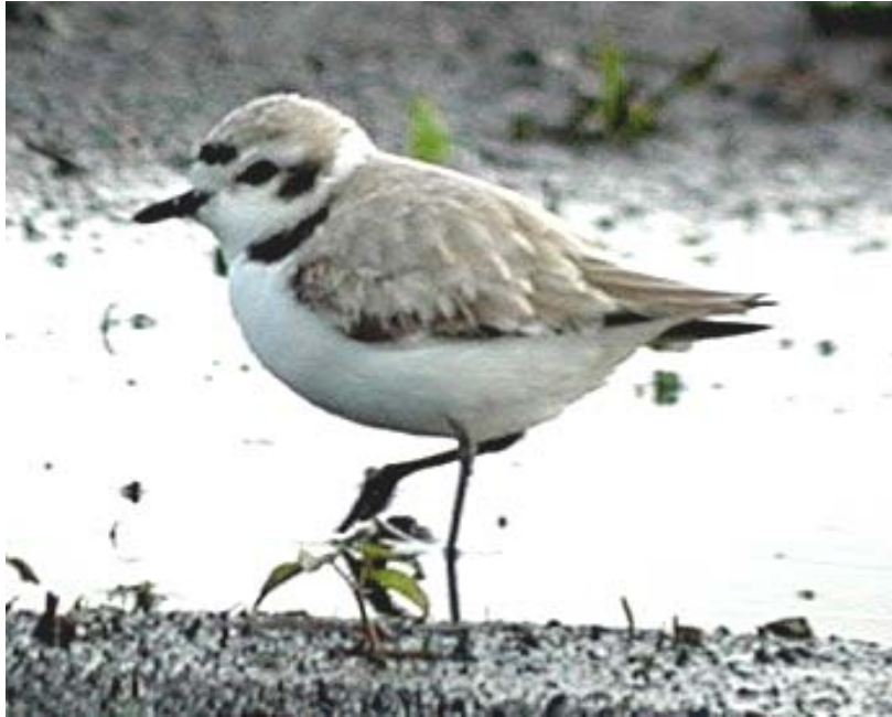
Snowy Plover- adult at Southwind Park, June 4, 2007 (HDB)