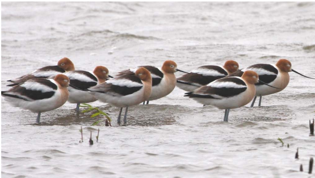
American Avocet- flock at Sangchris, April 25, 2010 (HDB)