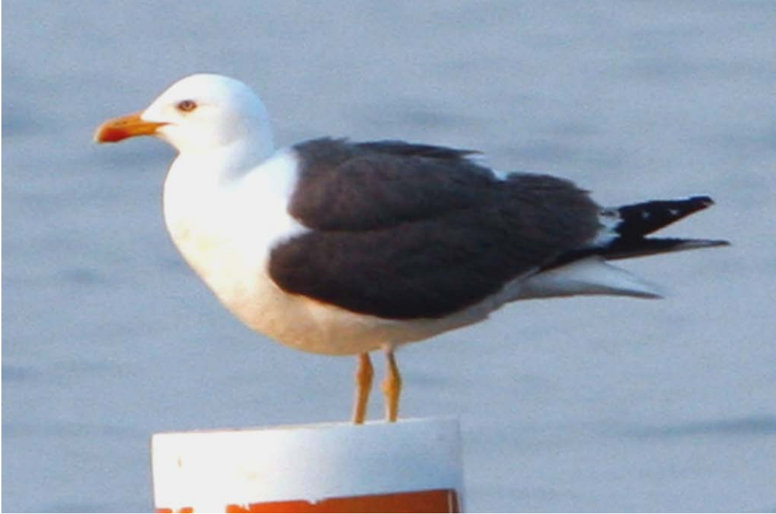
Lesser Black-backed Gull- adult at Lake Springfield, September 1, 2008 (HDB)