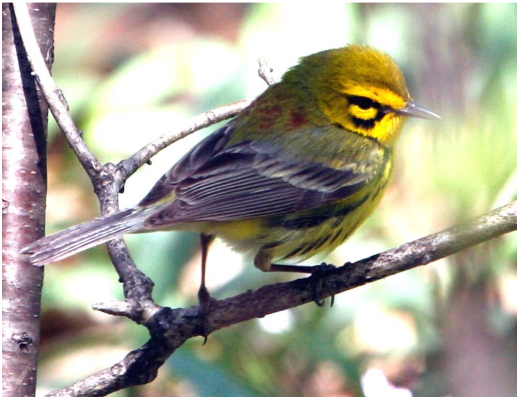
Prairie Warbler- ♂ at Washington Park, April 26, 2008 (HDB)