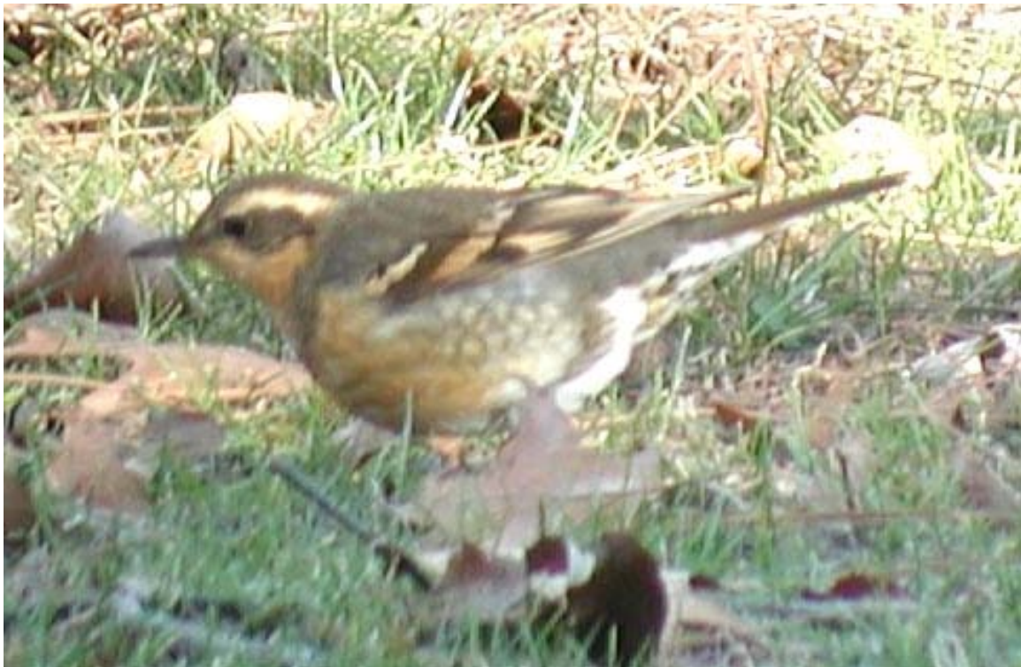
Varied Thrush- ♀ north of Andrew, December 30, 2003 (HDB)