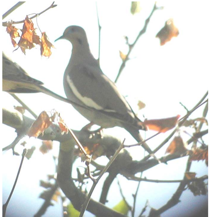
White-winged Dove- adult on west side of Springfield, May 17, 2005 (HDB)