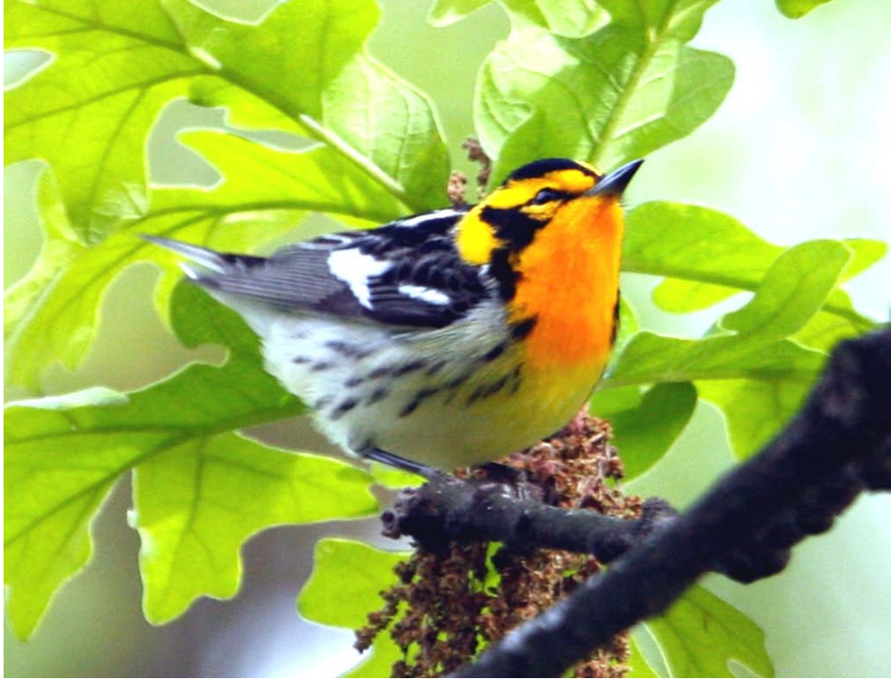
Blackburnian Warbler- ♂ at Oak Ridge Cemetery, May 16, 2009 (HDB)