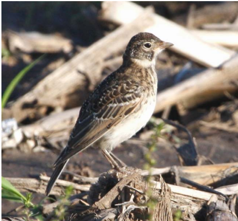
Horned Lark- juvenile in the valley of the South Fork, May 20, 2009 (HDB)