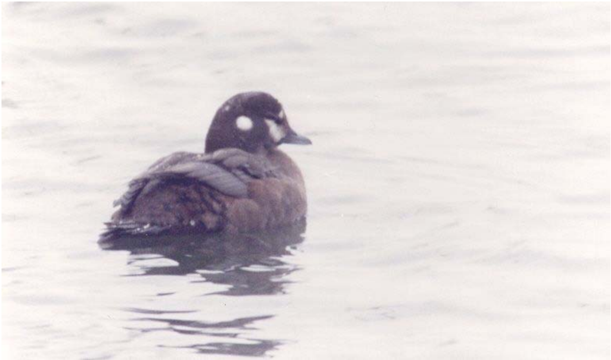
Harlequin Duck- ♀ at Lake Springfield, January 16, 1994 (DO)