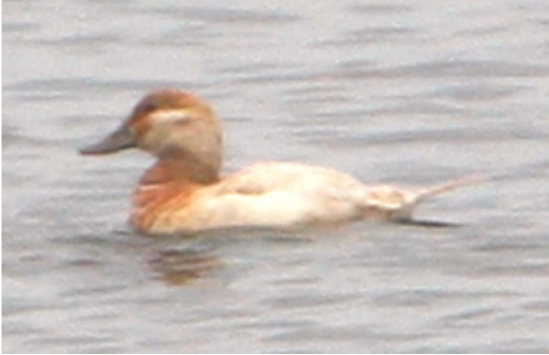
Ruddy Duck- diluted plumaged ♀? at Lake Springfield, March 23, 2009 (HDB)