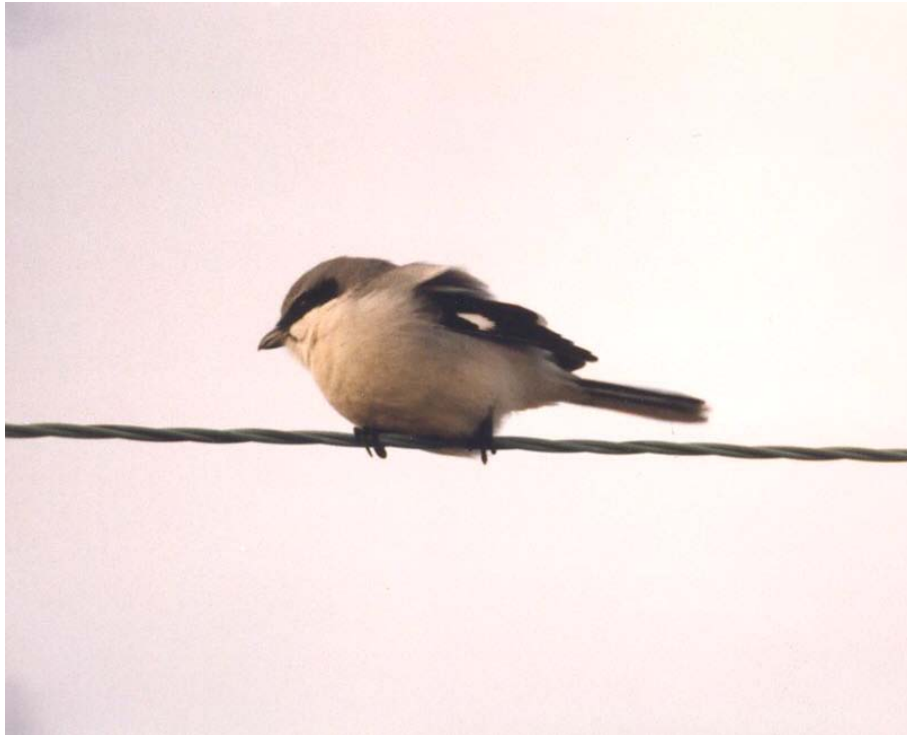
Loggerhead Shrike- adult east of Springfield, December 7, 1985 (DO)