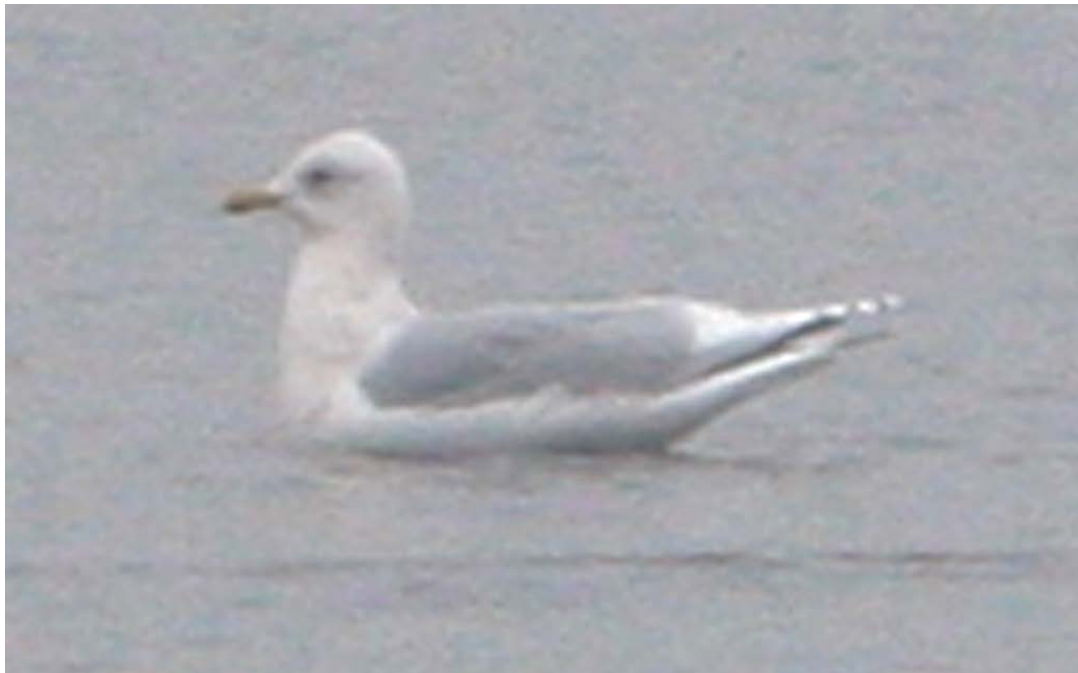
Iceland Gull- (Kumlien's) adult at Lake Springfield, December 21, 2010 (HDB)