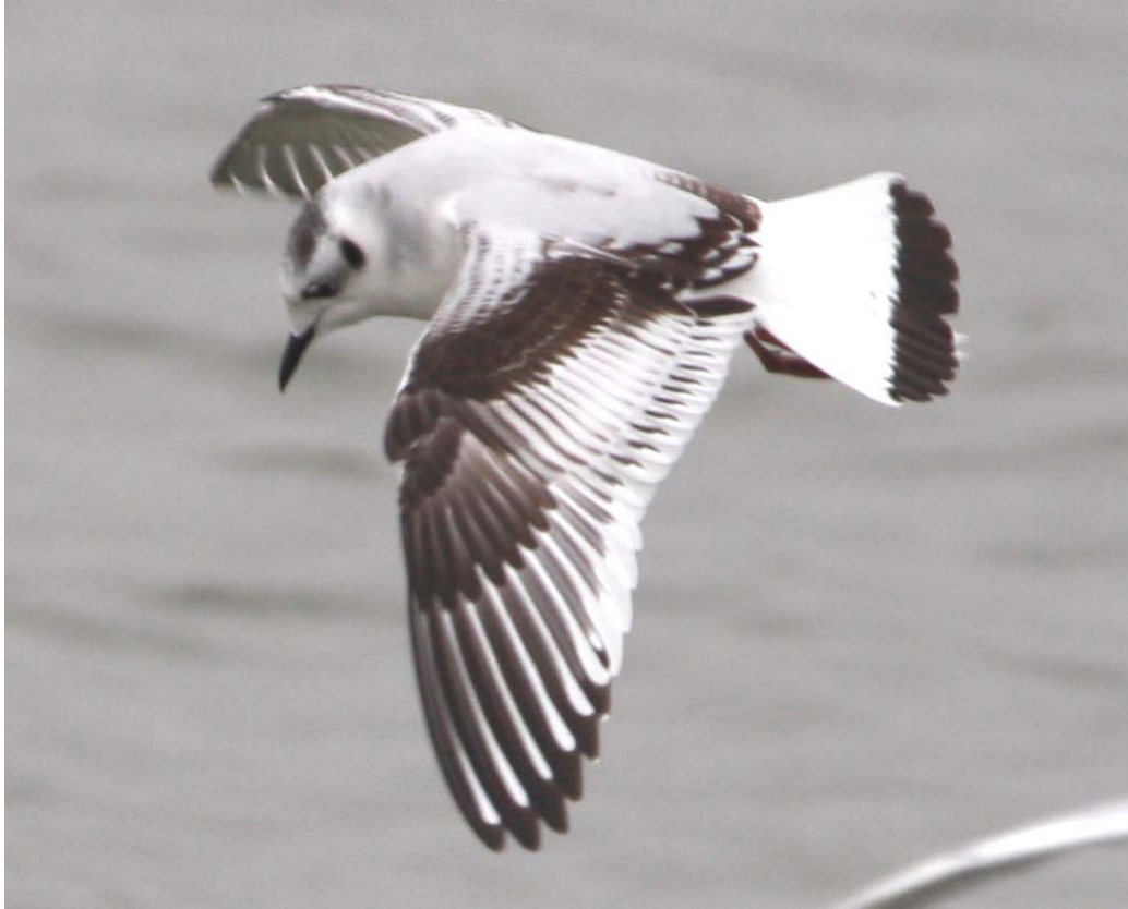
Little Gull- first winter at Buffalo sewer pond, November 21, 2010 (HDB)