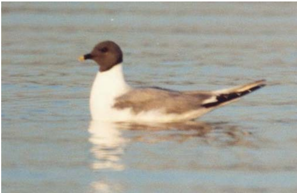
Sabine's Gull- adult at Lake Springfield, September 29, 1992 (DO)