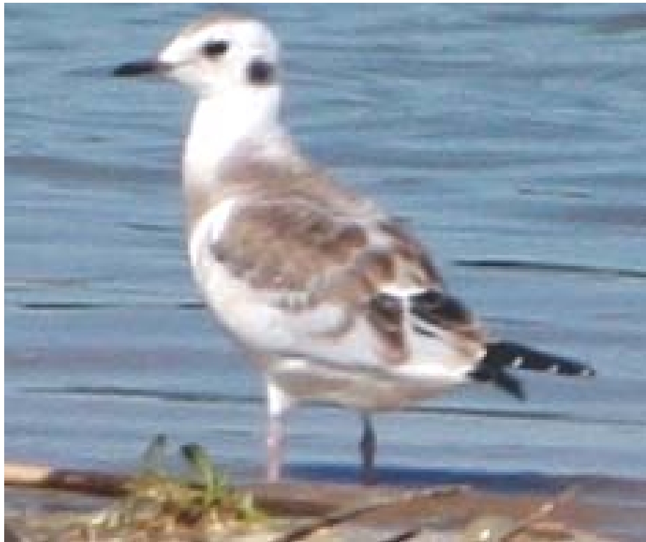
Bonaparte's Gull- juvenile at Buckhart, July 29, 2009 (HDB)