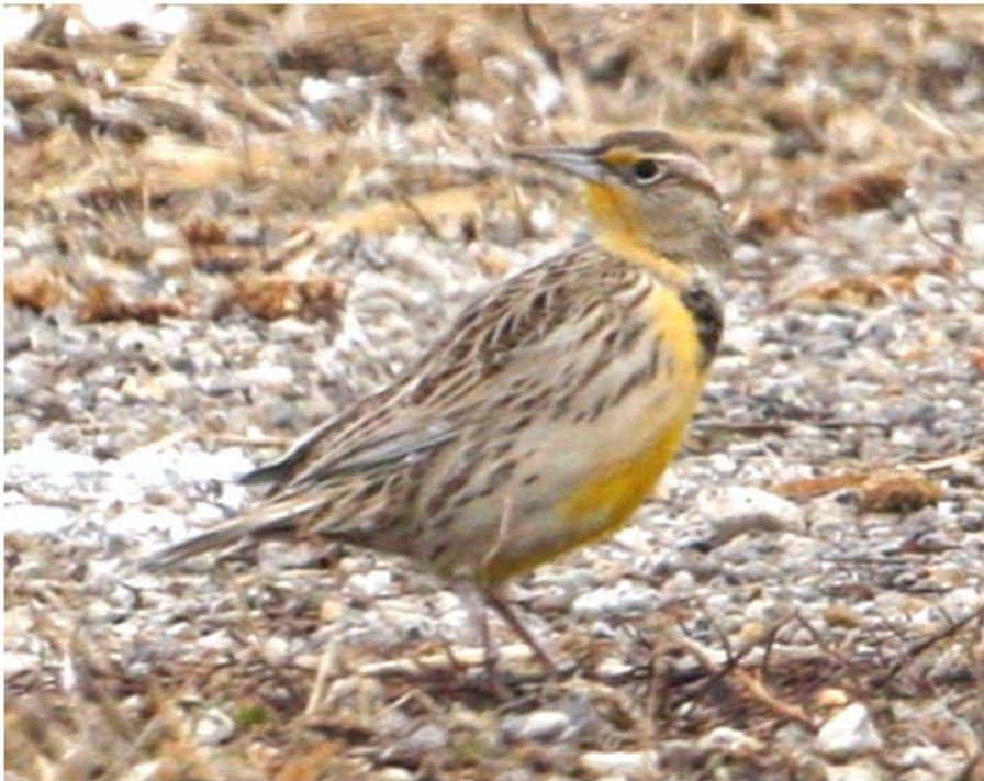
Western Meadowlark- near Clear Lake, February 14, 2010 (HDB)