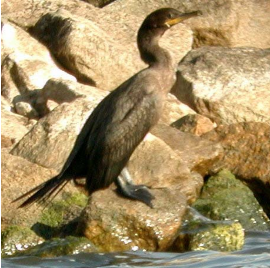
Neotropic Cormorant- subadult at Lake Springfield, September 2, 2005 (HDB)