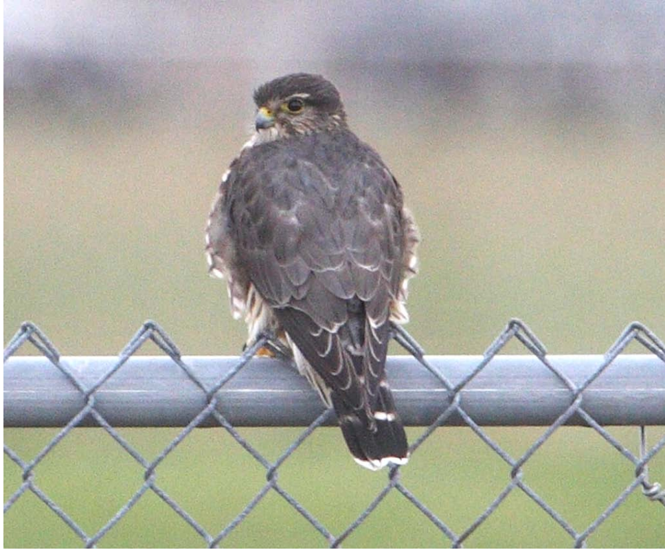
Merlin- ♂ at UIS soccer field, October 30, 2011