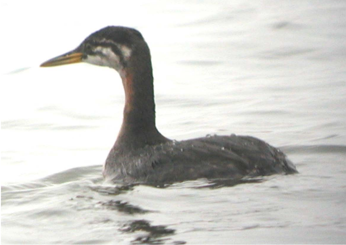
Red-necked Grebe-juvenile at Lake Springfield, November 14, 2006 (HDB)