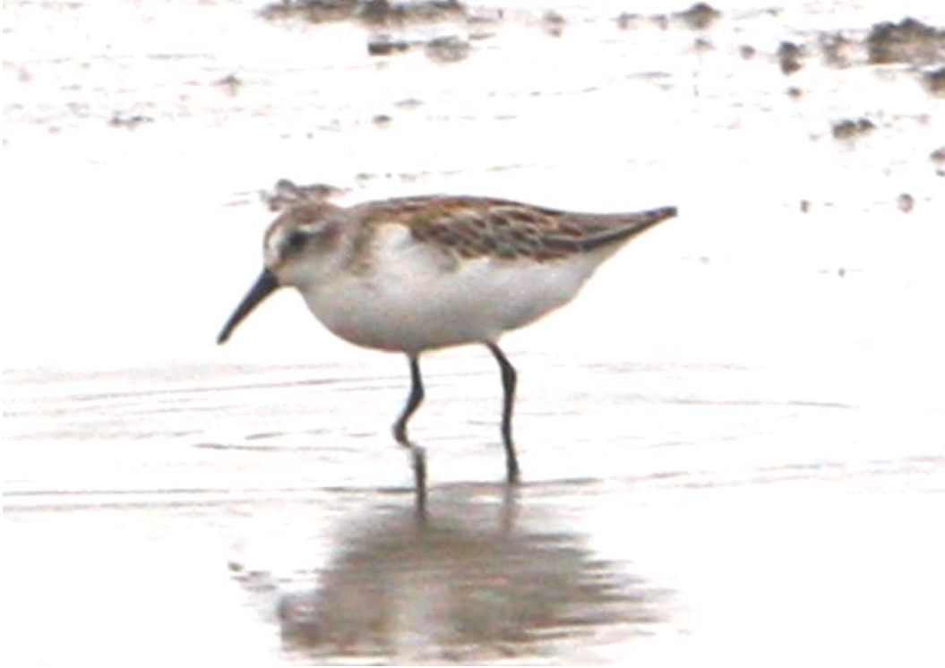
Western Sandpiper- juvenile at Cinder Flats, September 12, 2008 (HDB)