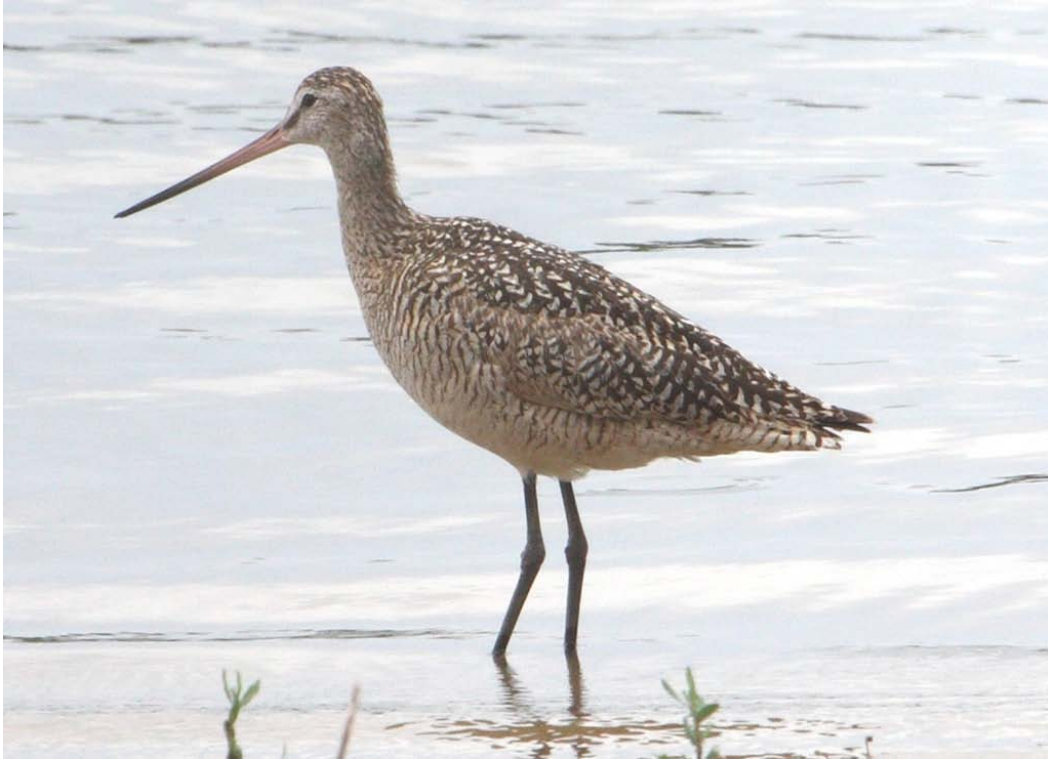
Marbled Godwit- adult at Lake Springfield beach, June 18, 2011 (HDB)