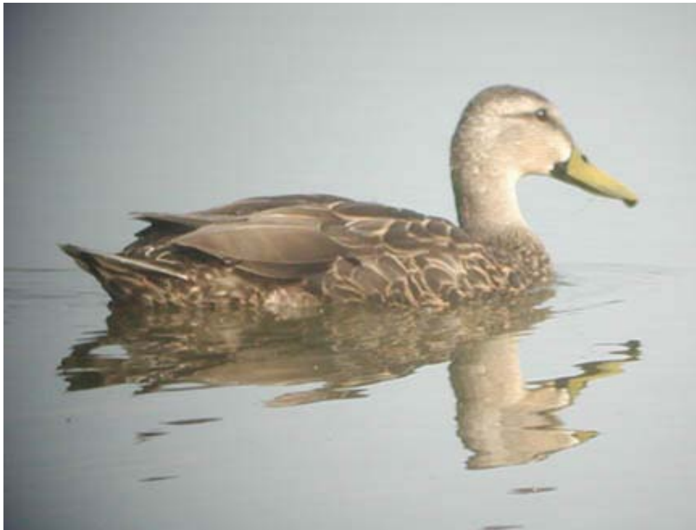
Mottled Duck- ♂ at Lake Springfield, May 21, 2004 (HDB)