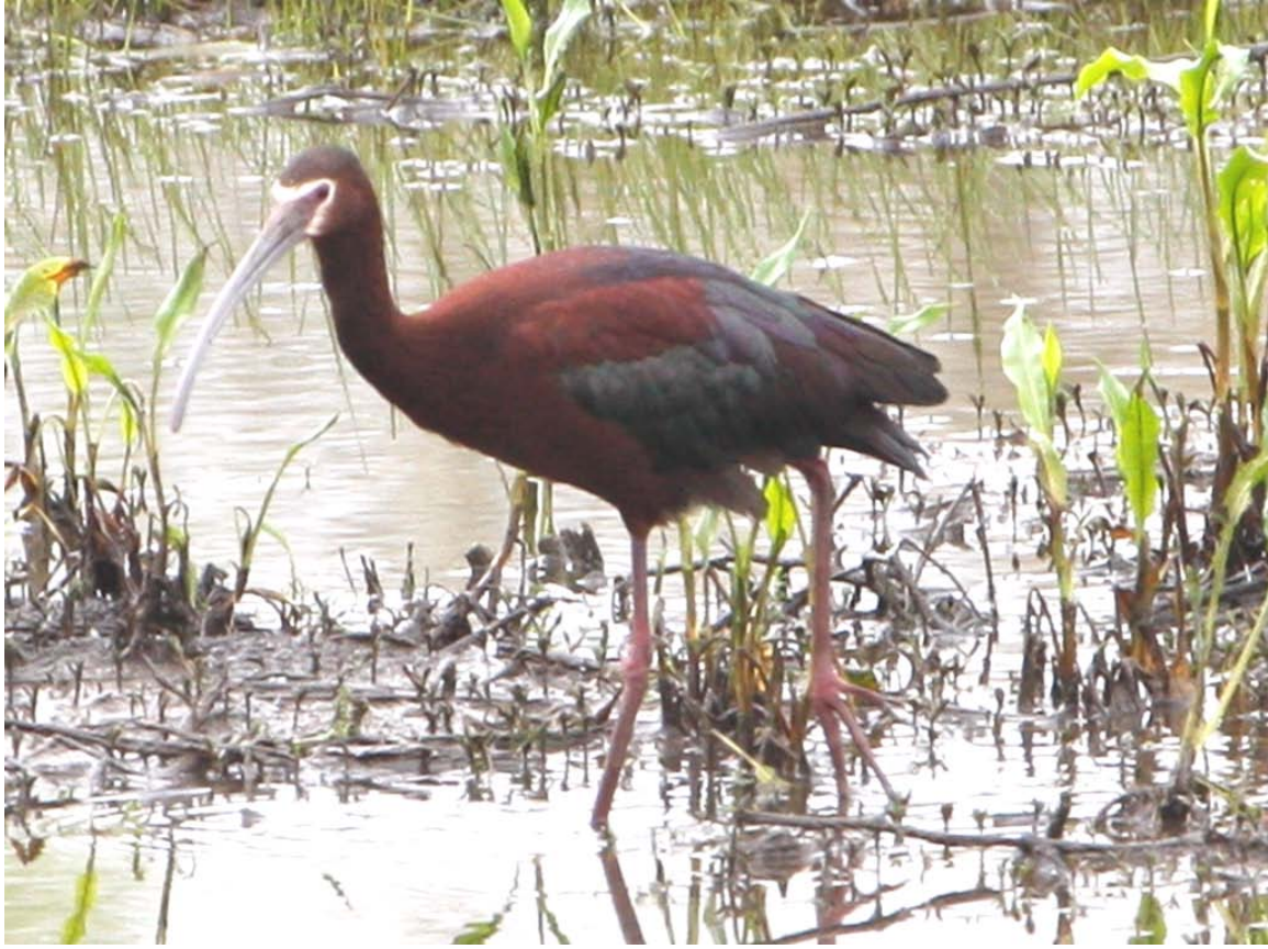
White-faced Ibis- adult Illinois Rt. 29 Bridge north, April 27, 2009 (HDB)