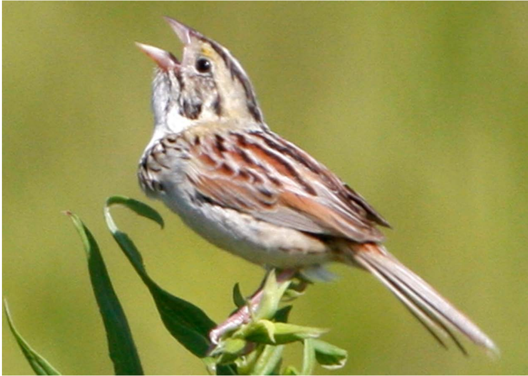
Henslow's Sparrow- ♂ at Marsh Road, July 26, 2009 (HDB)