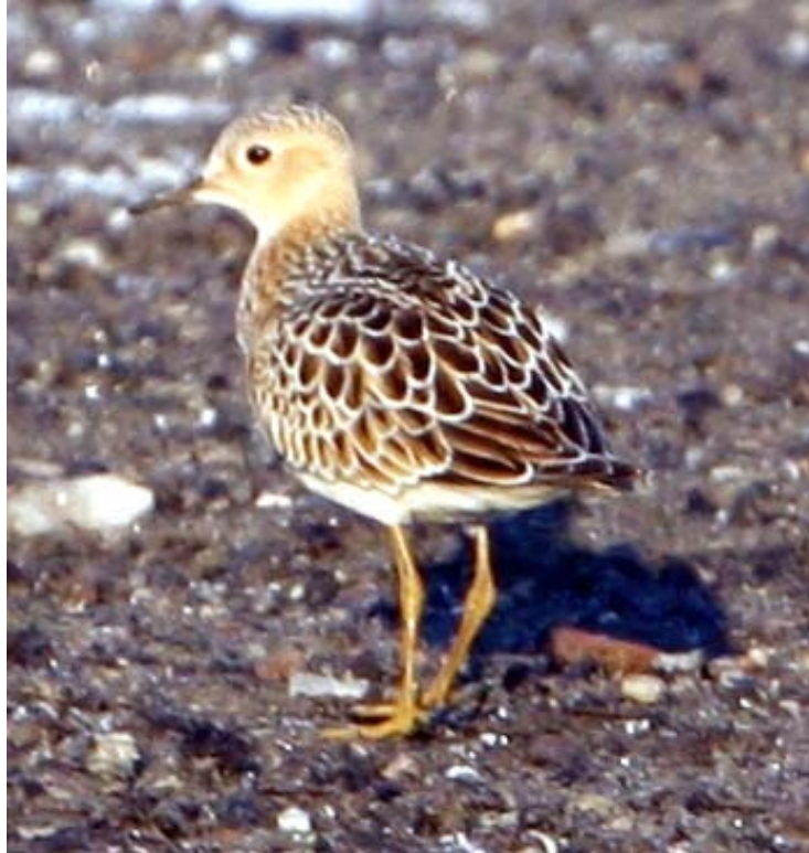
Buff-breasted Sandpiper- juvenile at Cinder Flats, September 2, 2009 (HDB)