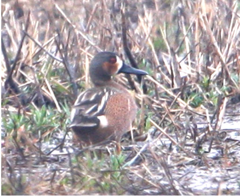
Blue-wing X Cinnamon Teal Hybrid- ♂ at Sangchris, April 5, 2010 (HDB)