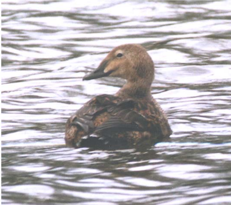
King Eider- ♀ at Lake Springfield, December 7, 2000 (DO)