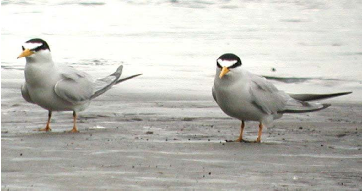
Least Tern- two adults at Cinder Flats, June 14, 2005 (HDB)