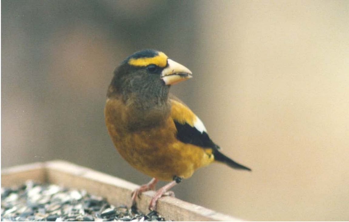
Evening Grosbeak- ♂ south of Springfield, January 17, 1985 (DO)