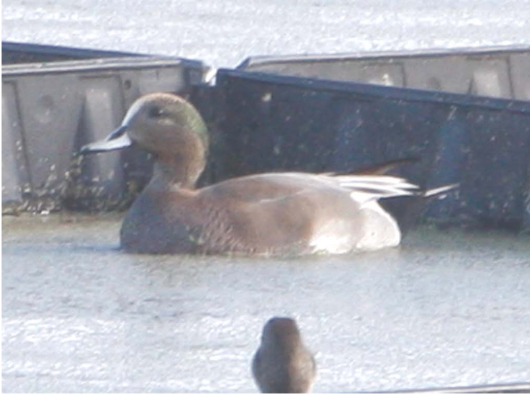
American Wigeon X Gadwall Hybrid- ♂ east side sewer pond, December 31, 2009 (HDB)