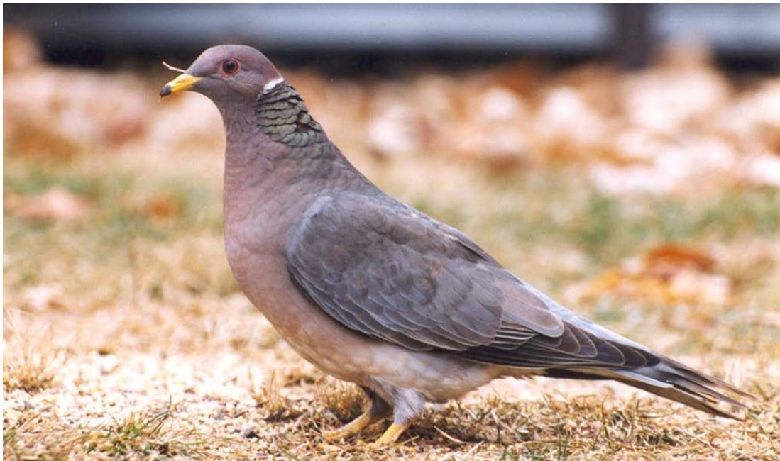
Band-tailed Pigeon- adult at Lake Springfield, December 28, 1996 (DO)