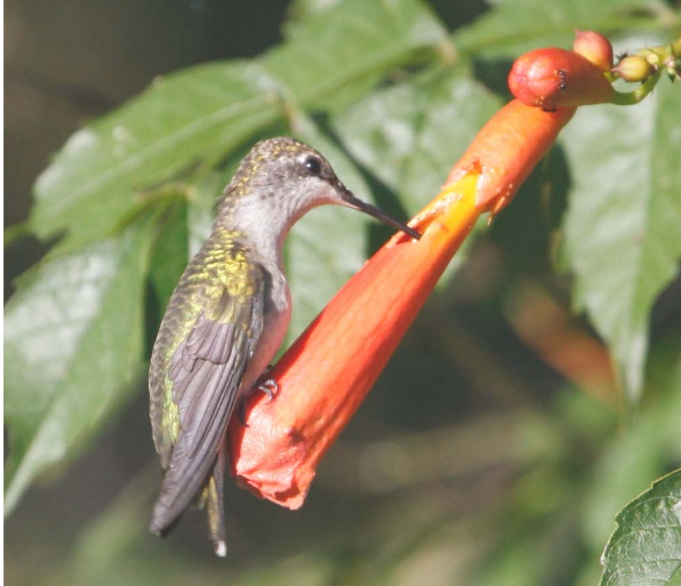
Ruby-throated Hummingbird- puncturing flower at Lincoln Gardens, August 16, 2008 (HDB)