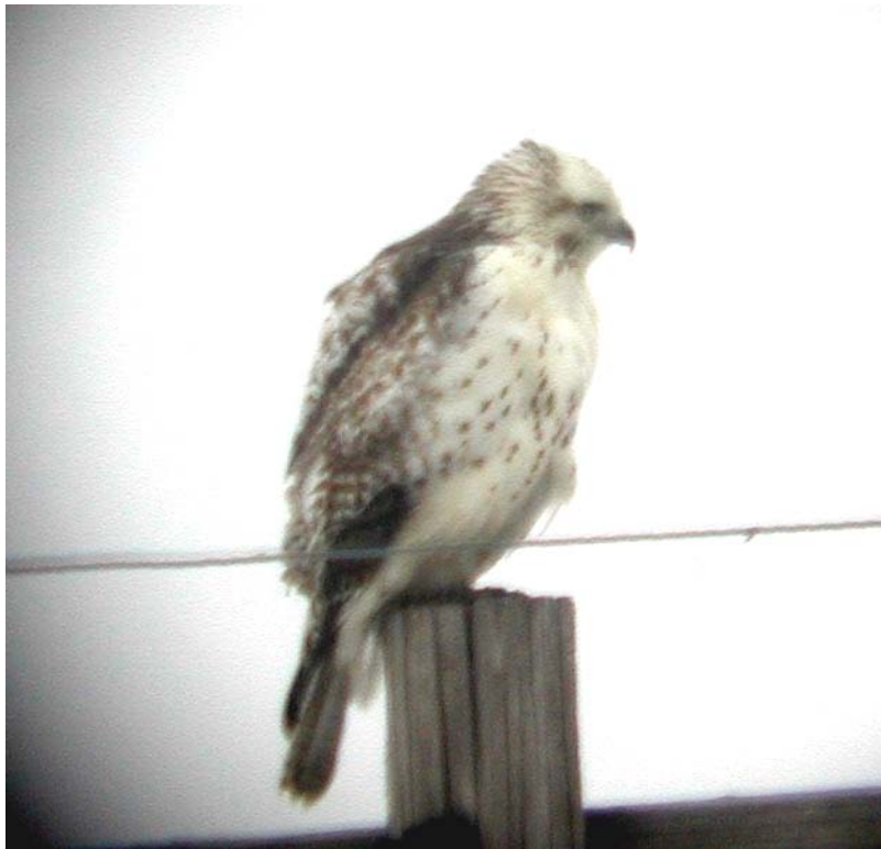
Red-tailed Hawk- immature Krider's form near Pleasant Plains, January 30, 2011 (HDB)