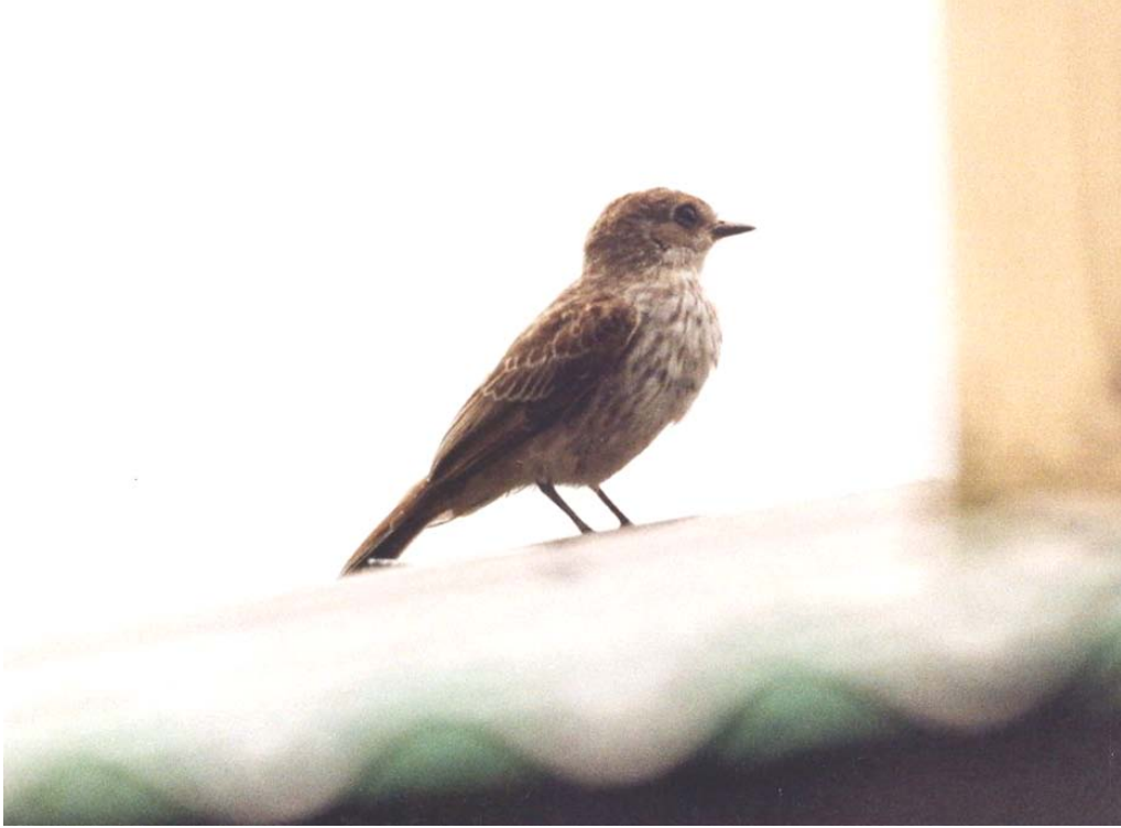
Vermilion Flycatcher- ♀ at Sangchris, September 18, 1992 (DO)