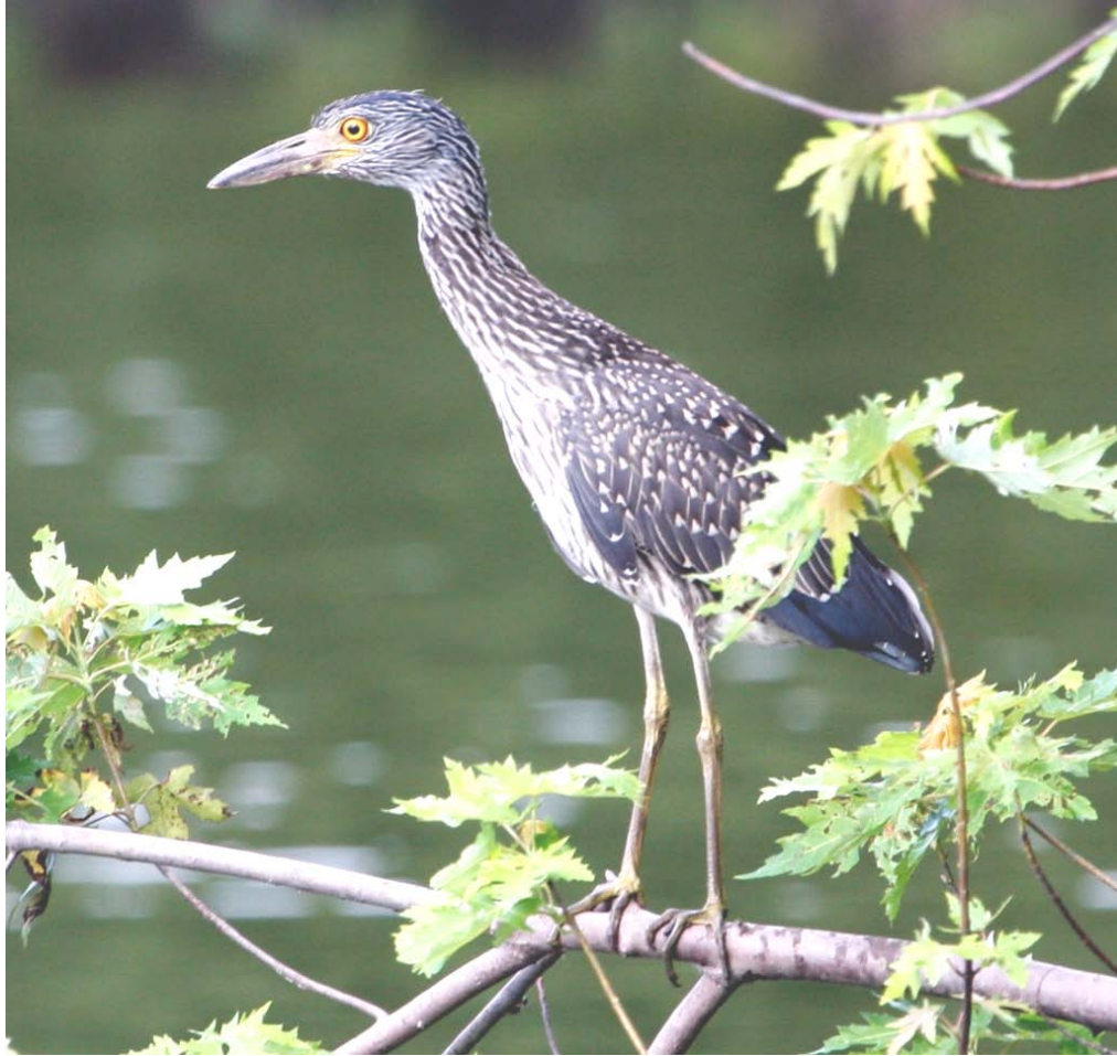
Yellow-crowned Night-Heron- juvenile at Riverside Park, July 30, 2010 (HDB)