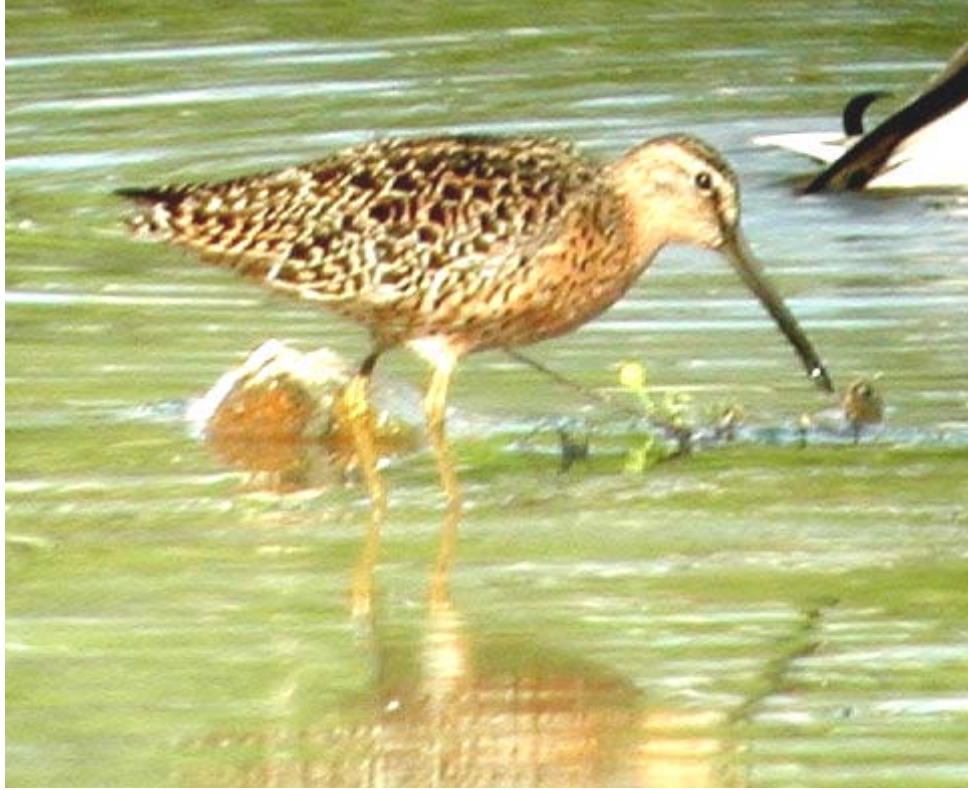
Short-billed Dowitcher- adult at Cinder Flats, May 20, 2007