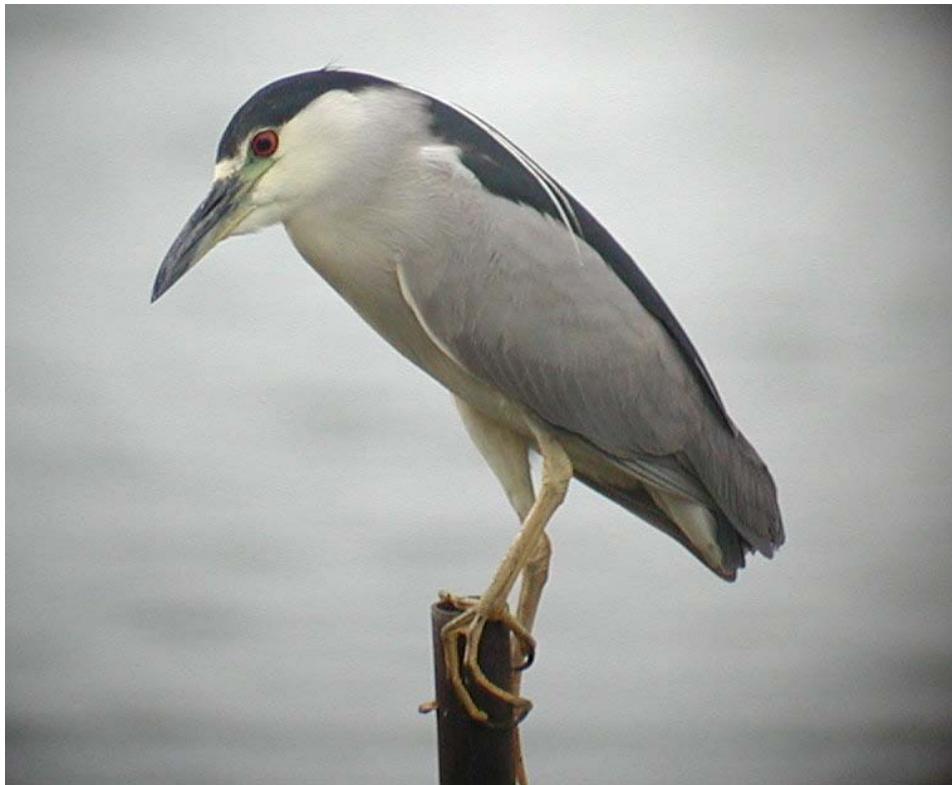
Black-crowned Night-Heron- adult at Lake Springfield, July 24, 2001 (HDB)