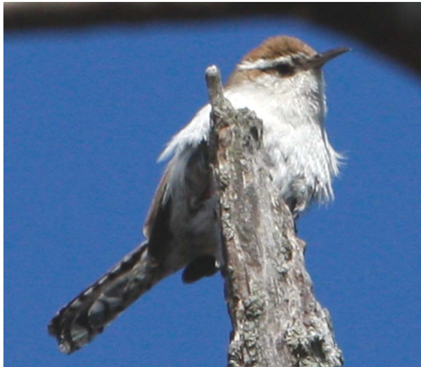
Bewick's Wren- ♂ at Riverside Park, March 23, 2011 (HDB)