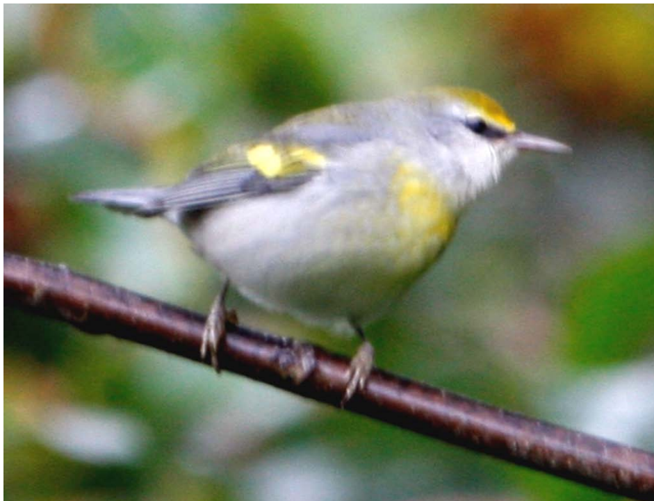
Blue-wing X Golden-wing Hybrid- ♂? east of Springfield, September 25, 2009 (HDB)