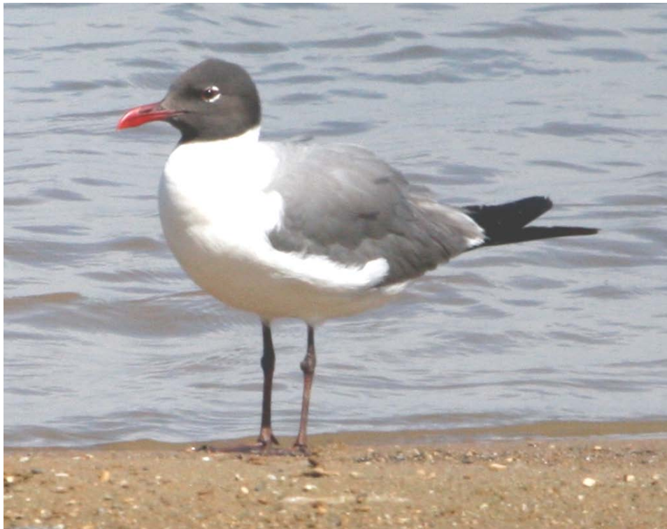
Laughing Gull- adult at Lake Springfield beach, June 8, 2008 (HDB)