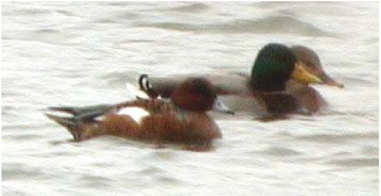
Eurasian Wigeon- ♂ in eclipse plumage at Sangchris, November 15, 2006 (HDB)