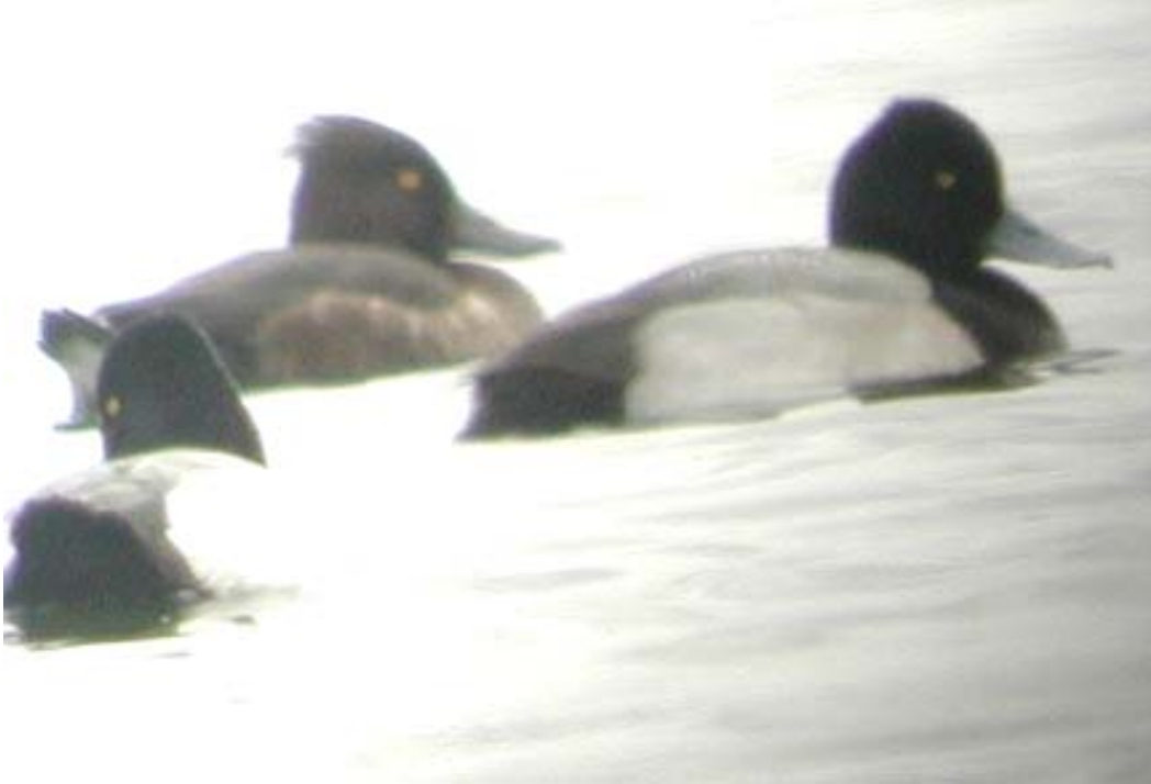
Tufted Duck- ♀ at Buffalo sewer pond, March 17, 2004 (HDB)