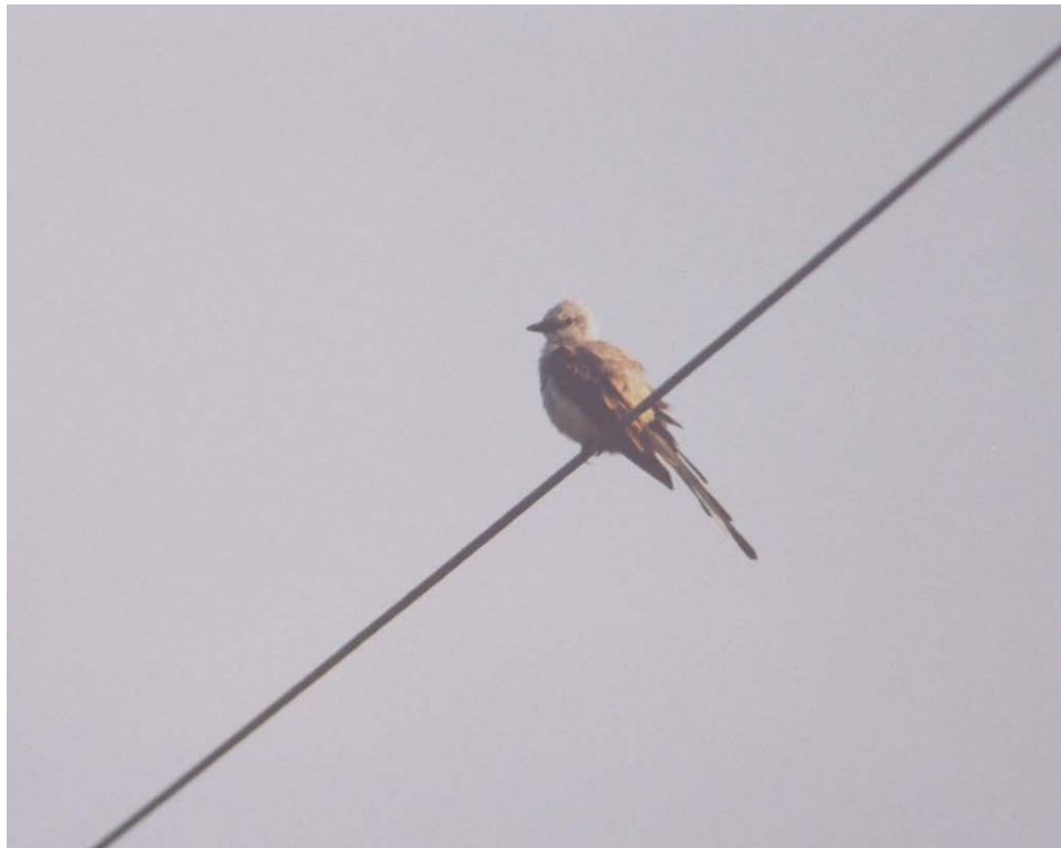
Scissor-tailed Flycatcher- adult in worn plumage at Auburn sewer pond, August 7, 2000 (DO)