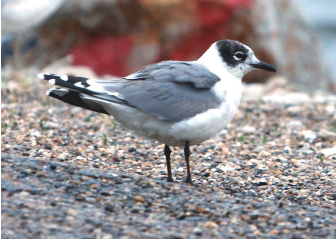
Franklin's Gull- first summer at Marine Pt., May 11, 2008