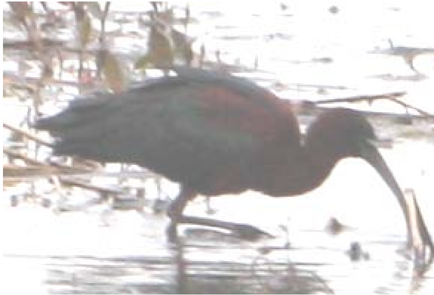
Glossy Ibis- adult north of New City, April 21, 2009 (HDB)