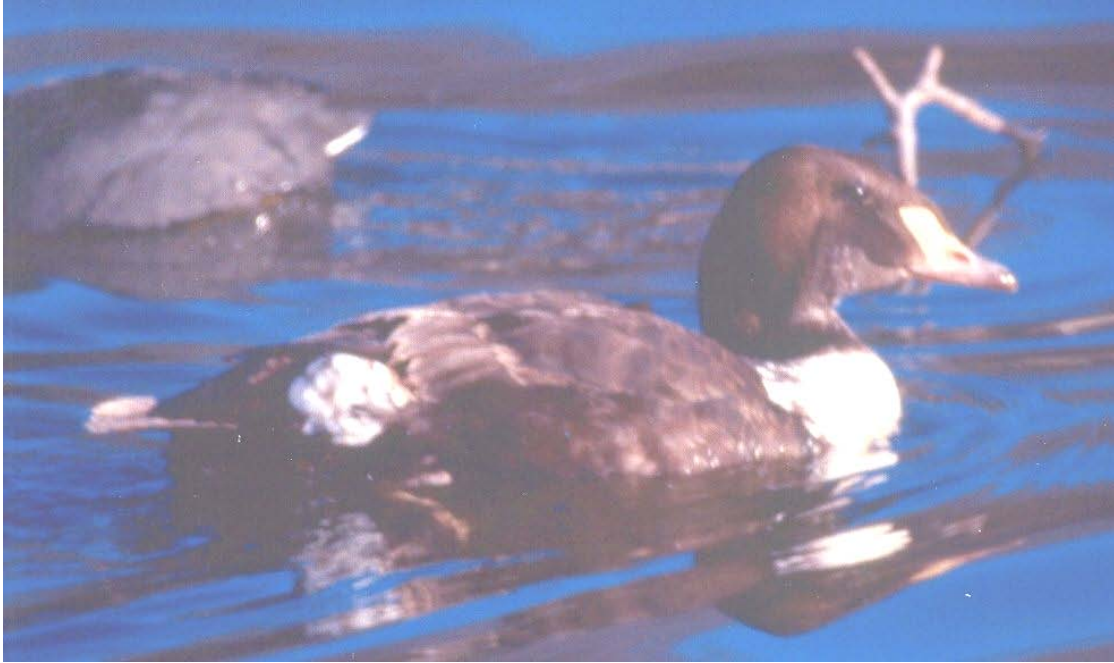
King Eider- immature ♂ at Lake Springfield, February 2, 1987 (DO)