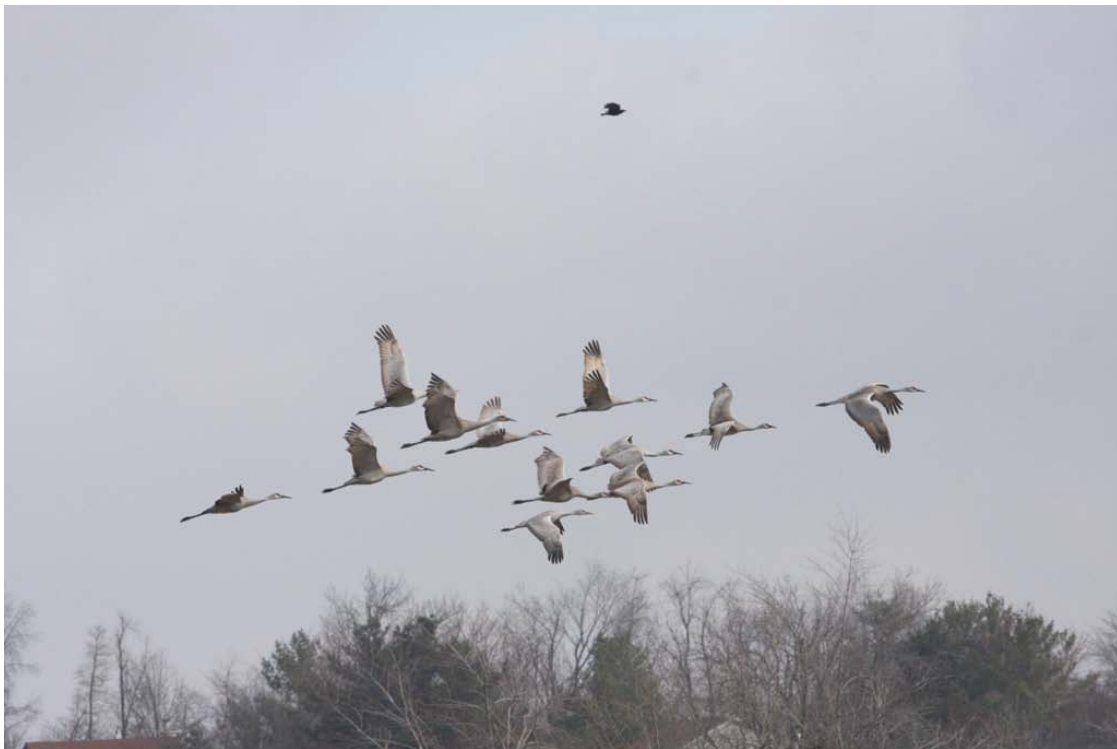
Sandhill Cranes- flock north of New City, March 14, 2008 (HDB)