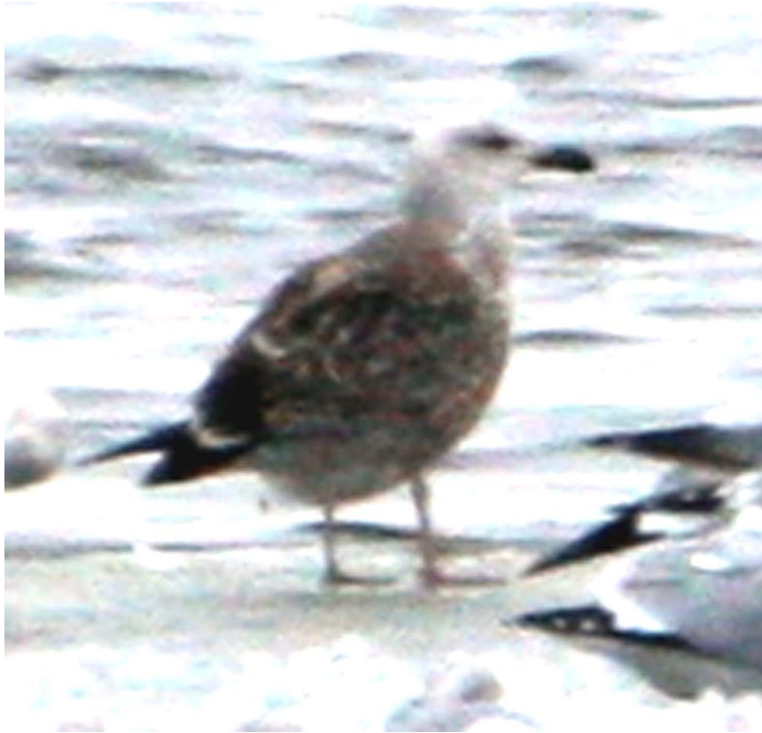
Great Black-backed Gull- first winter at Lake Springfield, January 26, 2009 (HDB)