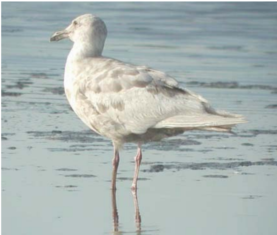
Glaucous-winged Gull- first summer at Cinder Flats, June 29, 2004 (HDB)