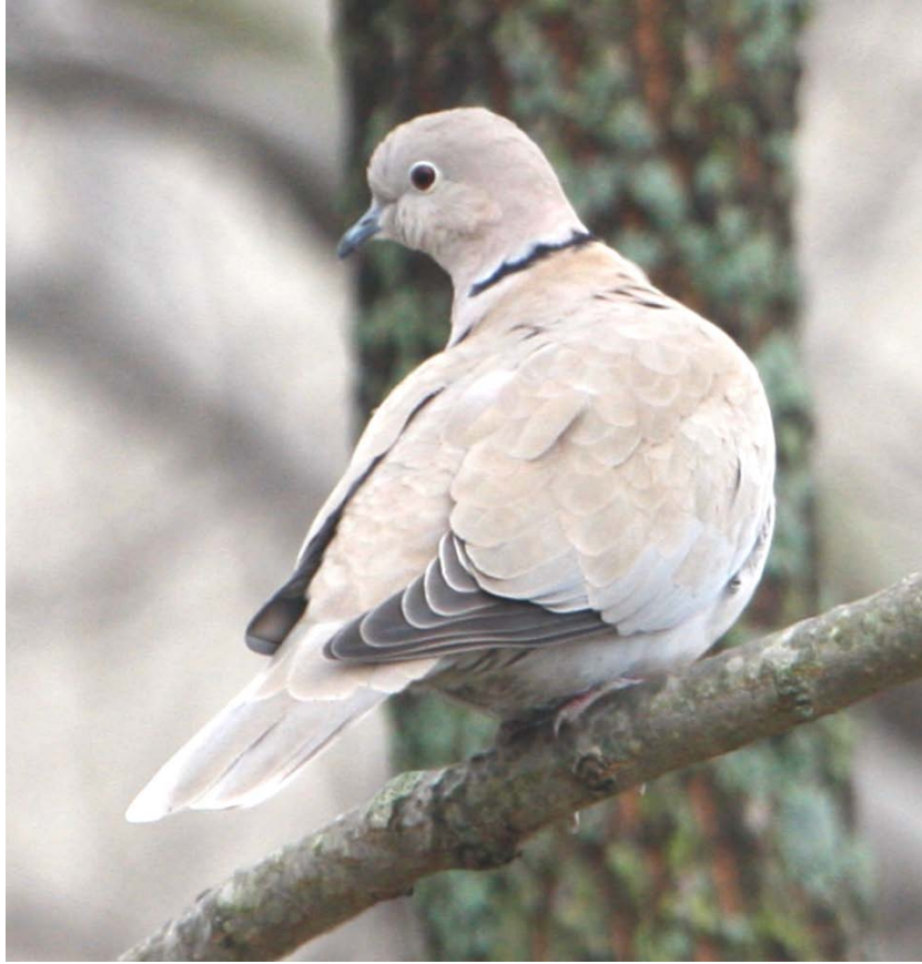
Eurasian Collared-Dove- adult at Berry, November 18, 2009 (HDB)