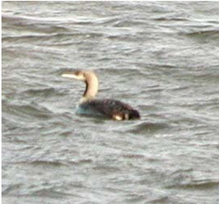
Pacific Loon- juvenile at Lake Springfield, October 28, 2006 (HDB)