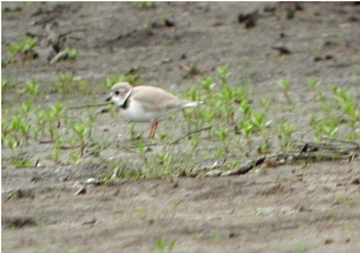
Piping Plover- adult ♀? at Buckhart, May 1, 2007 (HDB)