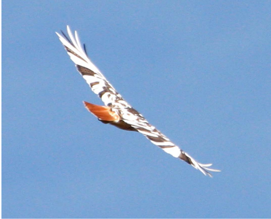
Red-tailed Hawk- leucistic adult near Beamington Corner, November 11, 2009 (HDB)