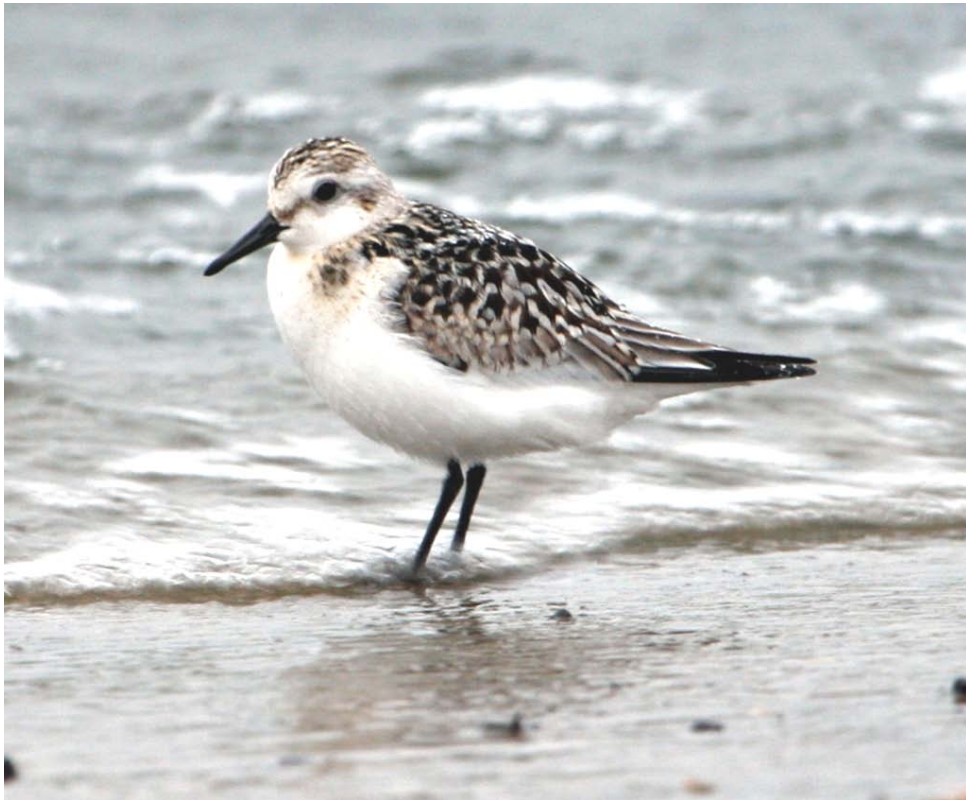
Sanderling- juvenile at Lake Springfield, September 4, 2008 (HDB)