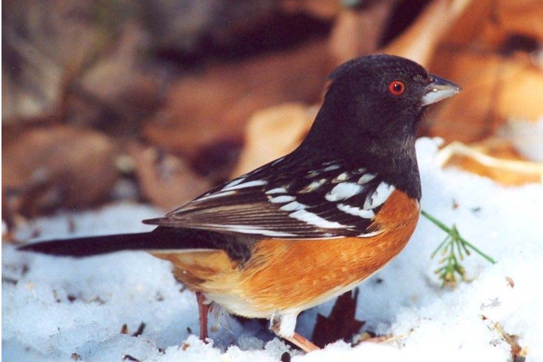
Spotted Towhee- ♂ northwest of Springfield, February 9, 1995 (DO)