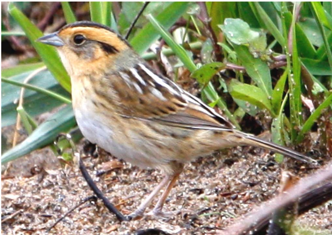
Nelson's Sharp-tailed Sparrow- at Sangchris, May 11, 2010