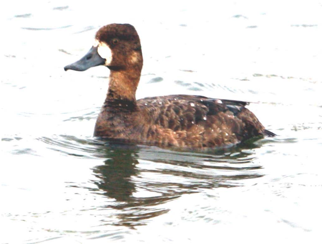
Greater Scaup- ♀ at Cinder Flats, May 2, 2008 (HDB)