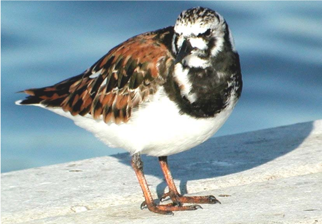
Ruddy Turnstone- adult at Lake Springfield, May 18, 2007 (HDB)