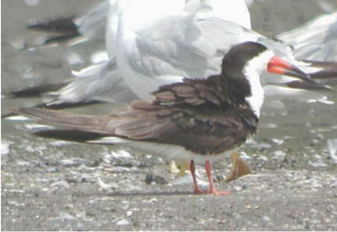
Black Skimmer- adult at Cinder Flats, July 23, 2004 (HDB)