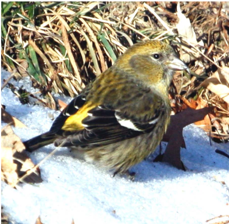
White-winged Crossbill- ♀ at Oak Ridge Cemetery, January 24, 2009 (HDB)