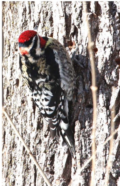
Sapsucker with red nape possible hybrid- ♂ at Hazel Dell Lane, January 15, 2009 (HDB)