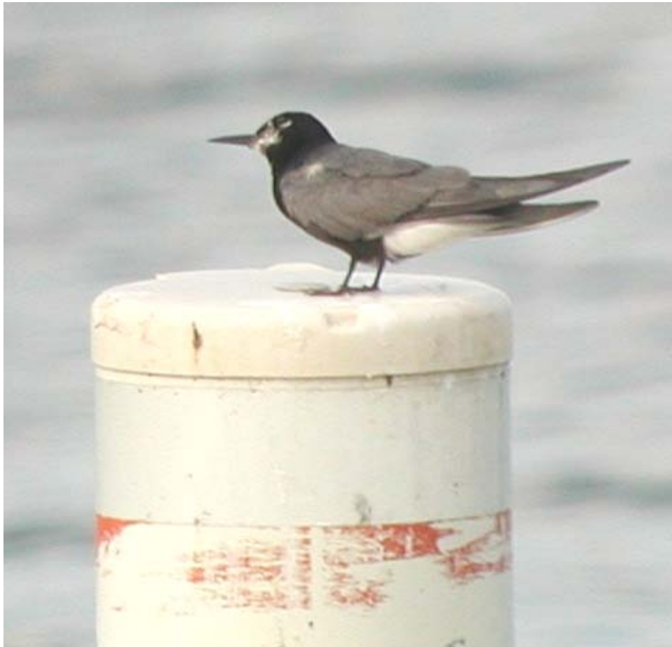
Black Tern- adult starting molt at Lake Springfield, July 7, 2005 (HDB)